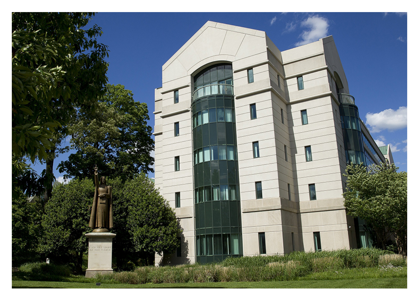
The U.S. Conference of Catholic Bishops building is seen May 8, 2017, in Washington. The conference said it would not renew its cooperative agreements with the federal government related to children's services and refugee support after its longstanding partnerships with the federal government in those areas became "untenable."

Despite decades of partnership with the Migration and Refugee Services of the U.S. bishops' conference, across administrations of both parties, including the first Trump administration, Granado said, "We've been placed in an untenable position now."