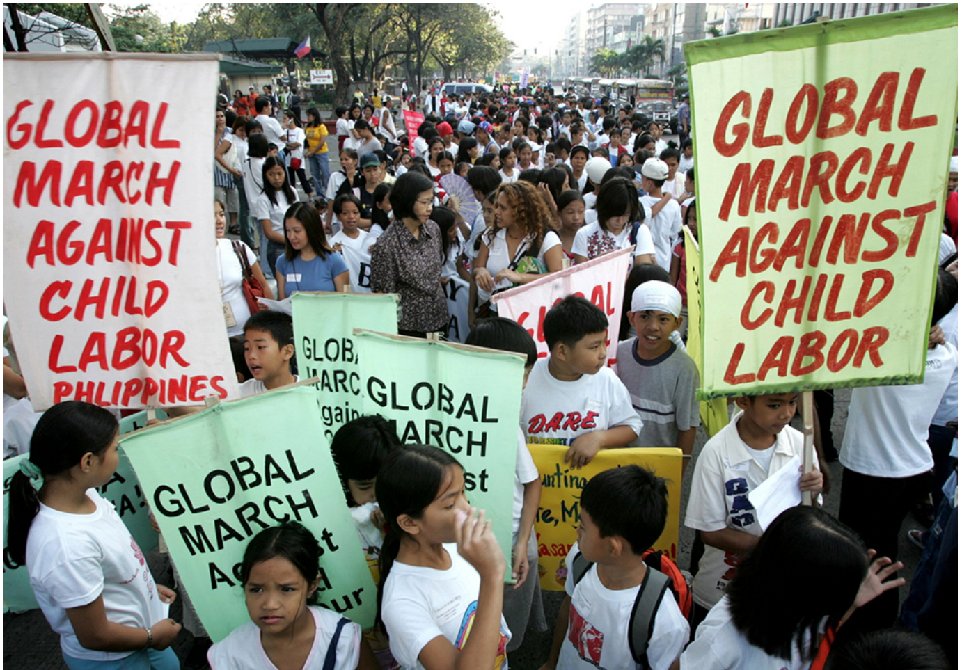
Filipino youths are pictured in a file photo as they carry placards during the celebration of the Global March Against Child Labor in Manila.

According to the International Labour Organization , a majority of child labor exists in agriculture, including harvesting for garment production , forestry , livestock and fishing . Children are often targeted since they are less likely to resist exploitation. For families struggling to survive hunger and poverty, children are expected to work to contribute to the household income.