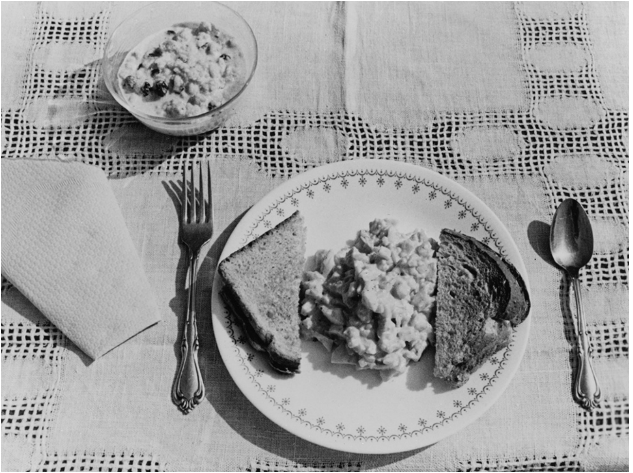
An example for a simple meal for the 1976 Operation Rice Bowl campaign consists of egg salad, toast and rice pudding.