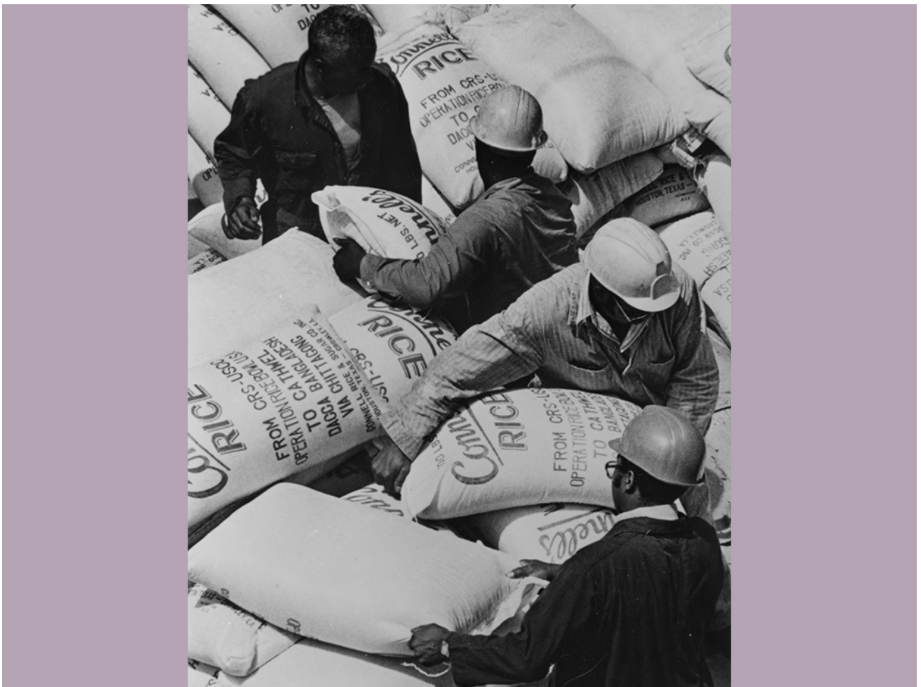
Workers in Philadelphia load a shipment of rice bound for Bangladesh in summer 1976, in a relief effort handled by Catholic Relief Services, using funds from the first national Operation Rice Bowl campaign.

This group worked together with other local faith communities in collecting money to feed the hungry. The next year, this effort became a national program and the following year the U.S. bishops made the relief effort an official Catholic Relief Services program.