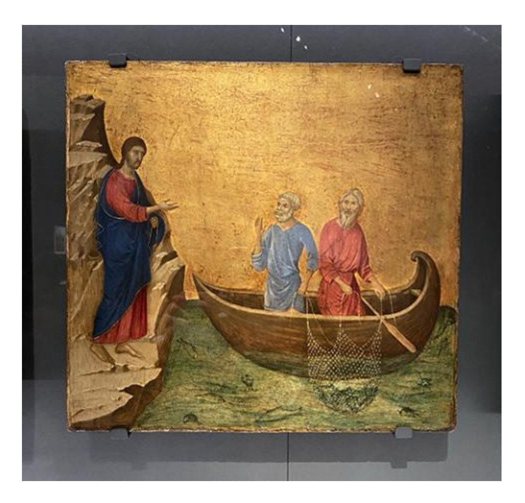
"The Calling of the Apostles Peter and Andrew" by Duccio di Buoninsegna, from the back predella of Maestà Altarpiece at Siena Cathedral, ca. 1308-11 (Michael Centore)

Each of the eight panels from the "predella," or altar shelf, on display from the rear of the "Maestà," is a window onto the gospel. The jewel-like scenes shimmer in their interplay of color, pattern and passages of gold, like icons where the artist's personality is allowed, ever so discreetly, to shine through.