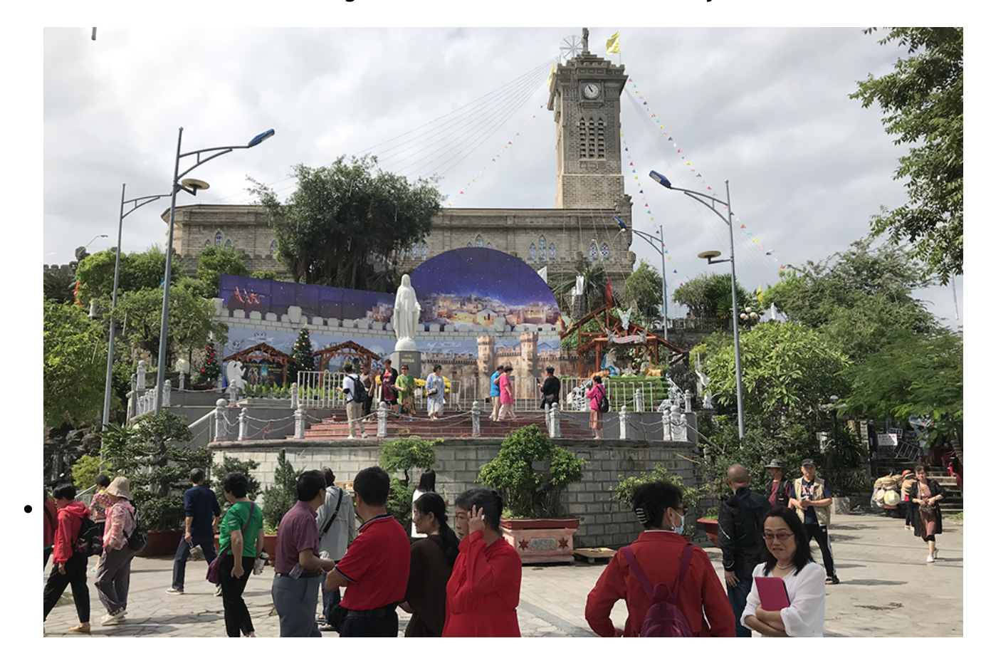
Tourists visit a big crèche outside the Christ the King Cathedral in Nha Trang, central Vietnam on Dec. 20.

A crèche made of grass, wood, bonsais and other used items in front of Bac Thanh Church in Nha Trang, central Vietnam on Dec. 20.