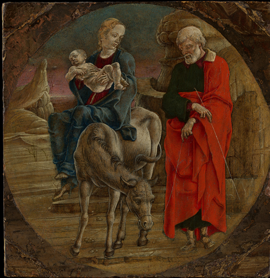
"The Flight into Egypt," circa 1470s painting by Cosmè Tura (Metropolitan Museum of Art)