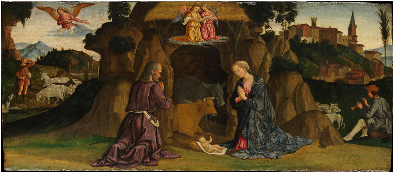
"The Nativity," circa 1480s painting by Antoniazio Romano (Metropolitan Museum of Art)

in an interview for U.S. Catholic, "It is easier for a tradition that has historically had a lot of power to talk about love of enemies than it is for people who have struggled to survive for centuries."