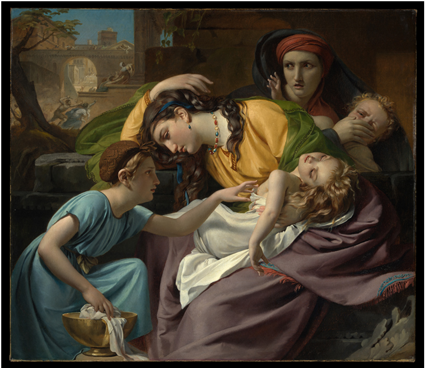
"The Massacre of the Innocents," an 1824 painting by François Joseph Navez (Metropolitan Museum of Art)

But joy isn't the only theme of the season. Along with the popular readings that proclaim good news, Advent Scripture readings also offer warnings of divine wrath. Often overlooked amid the holiday music and cheering decor, talk of apocalypse and judgment dot the landscape of December Masses.