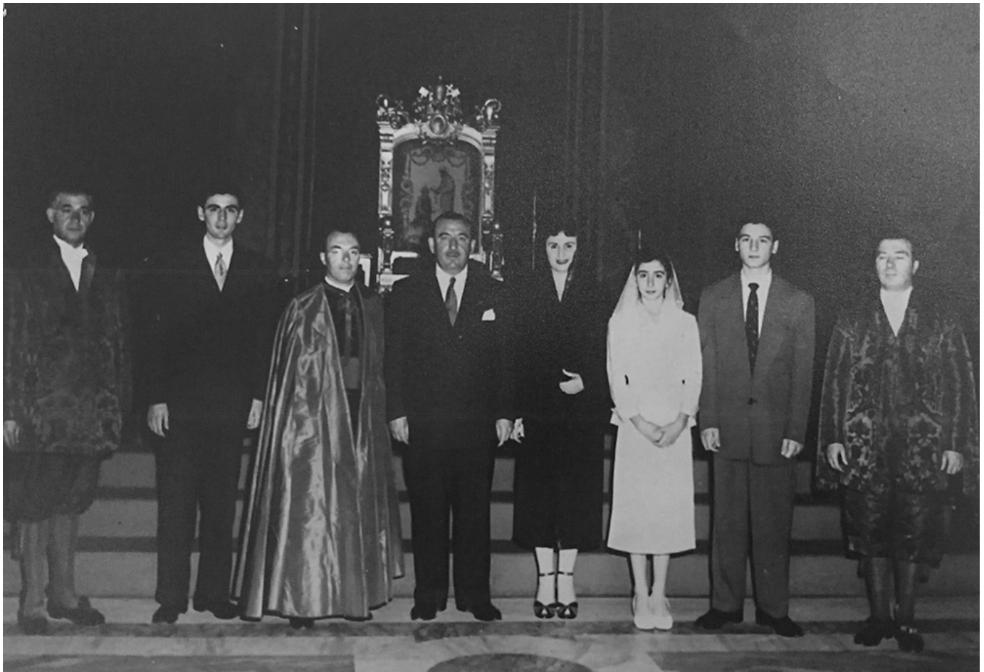
Former House Speaker Nancy Pelosi (in white dress) with her family during a visit at the Vatican in 1954.

Then, she paused, closed her eyes and quoted the Gospel of Matthew. " 'When I was hungry, you fed me. When I was naked, you clothed me. When I was homeless, you sheltered me. When I was a stranger, you welcomed me. When I was in prison, you visited me' — except right now," she said.