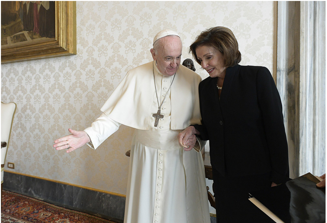
Pope Francis greets then-U.S. House Speaker Nancy Pelosi, D-Calif., during a private audience Oct. 9, 2021, at the Vatican.

At the same time, her criticism is unsurprising given her personal faith and longstanding criticism of China's human rights record. Pelosi, who angered China in 2022 with a trip to Taiwan as one of her last acts as speaker, noted that Republicans and Democrats both joined her objection over Sino-Holy See relations. Pelosi said she was so troubled with the Vatican's agreement that she took her complaints to the papal nuncio, the Vatican's ambassador in the United States.