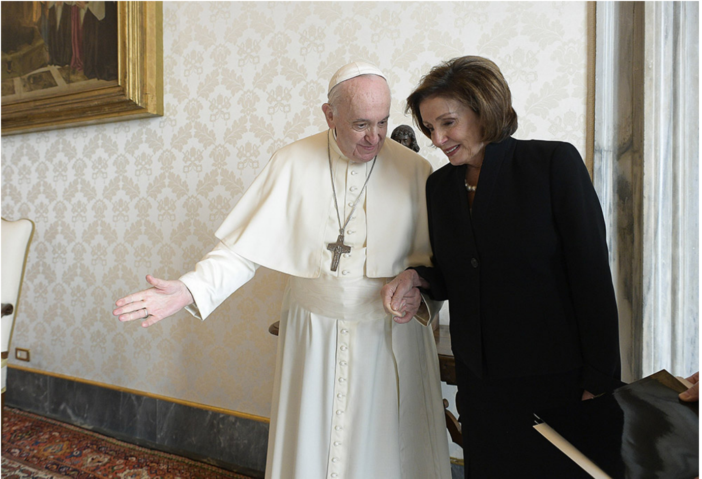
Pope Francis greets then-U.S. House Speaker Nancy Pelosi, D-Calif., during a private audience Oct. 9, 2021, at the Vatican.

At the same time, her criticism is unsurprising given her personal faith and longstanding criticism of China's human rights record. Pelosi, who angered China in 2022 with a trip to Taiwan as one of her last acts as speaker, noted that Republicans and Democrats both joined her objection over Sino-Holy See relations. Pelosi said she was so troubled with the Vatican's agreement that she took her complaints to the papal nuncio, the Vatican's ambassador in the United States.