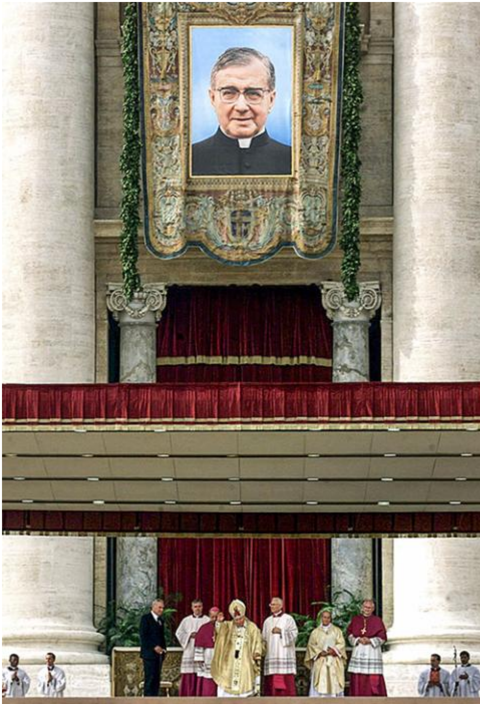
Pope John Paul II blesses pilgrims at the end of the canonization Mass for Opus Dei founder Msgr. Josemaría Escrivá Oct. 6, 2002, outside St. Peter's Basilica at the Vatican.

Because of its secrecy and reach, it has drawn scrutiny from the Vatican. Under Pope John Paul II, Opus Dei was celebrated and elevated to a prelature, with Escrivá declared a saint. Pope Francis has been warier, with the organization becoming the