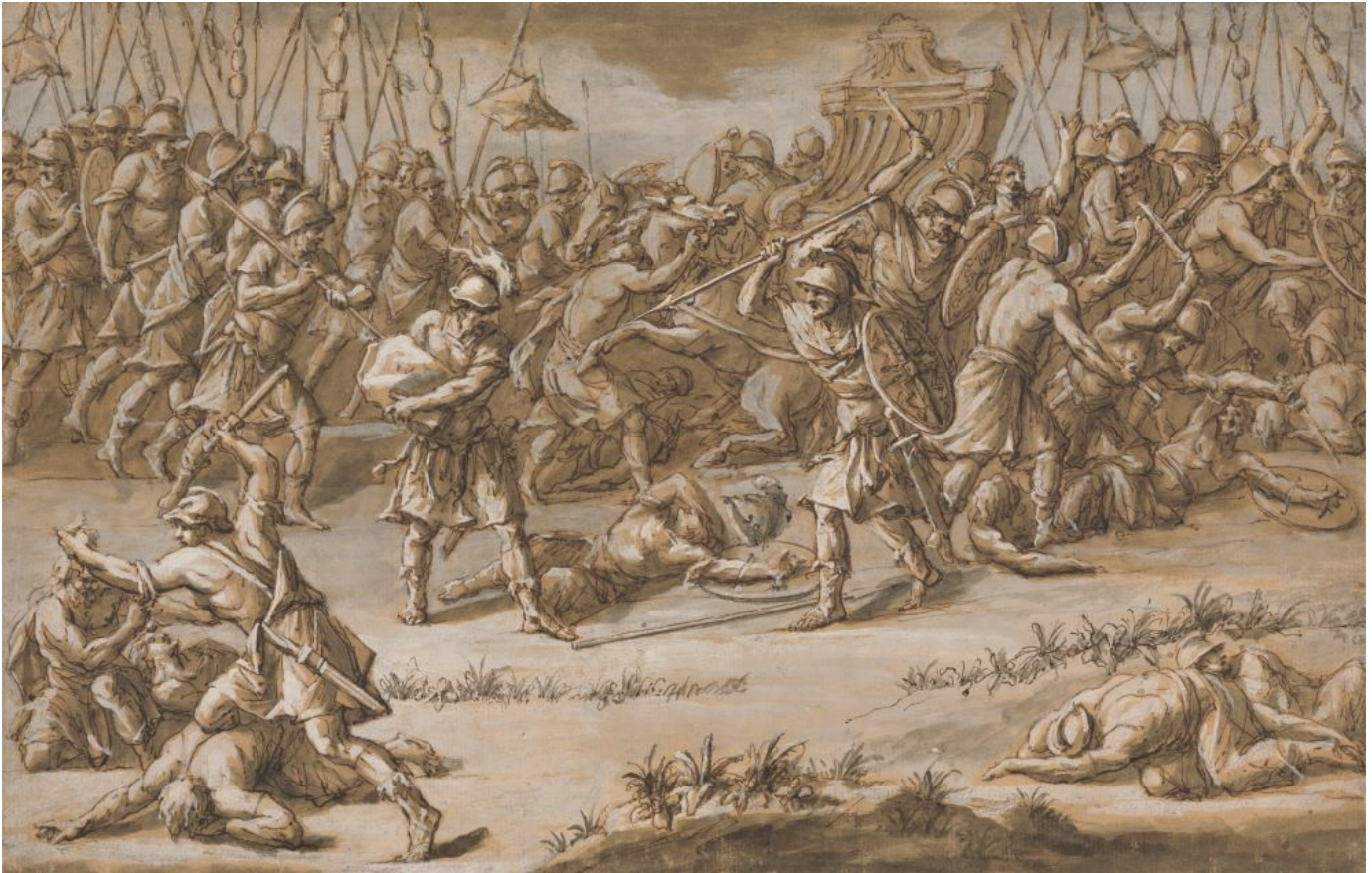
Illustration to "The Iliad" (between 1760 and 1769) by John Michael Rysbrack (Flemish, 1694-1770)