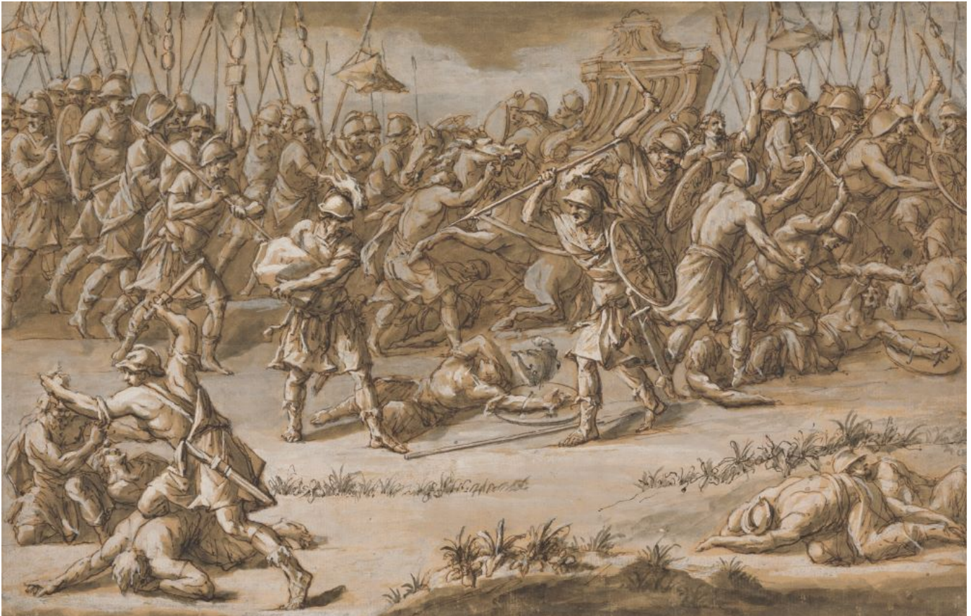
Illustration to "The Iliad" (between 1760 and 1769) by John Michael Rysbrack (Flemish, 1694-1770)