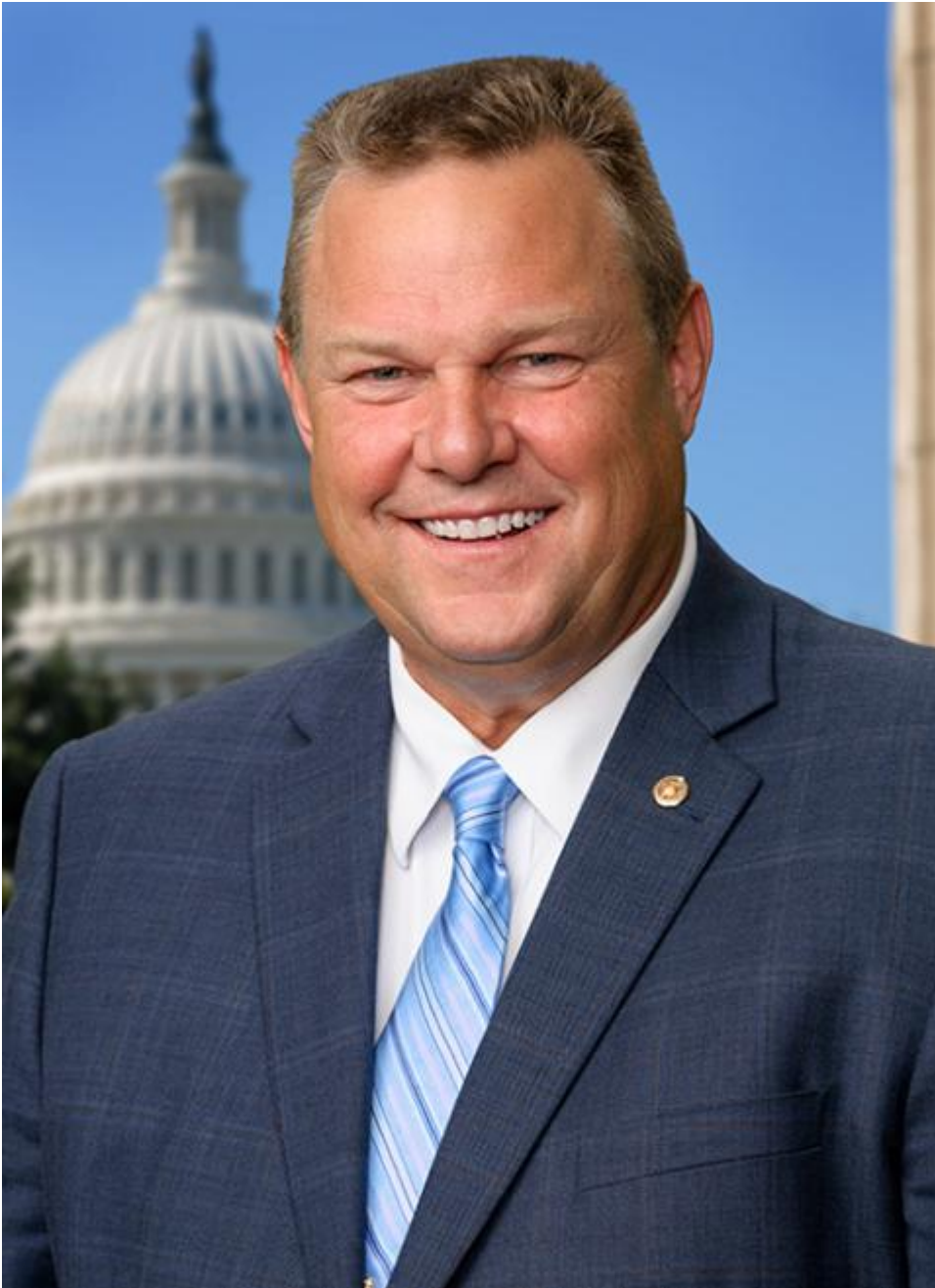
Official portrait of Sen. Jon Tester of Montana ( tester.senate.gov )

In Montana, former Navy SEAL and businessman Tim Sheehy has opened up a consistent lead over incumbent Democratic Sen. Jon Tester. Sheehy's business is no mom-and-pop shop: He makes about $5 million a year as CEO of an aerial firefighting company, and an additional $2 million in non-investment income from other ventures. He is not self-funding; A gaggle of billionaires is pouring money into the race . Tester, a farmer, is not poor, to be sure. His net worth is over $3.6 million.