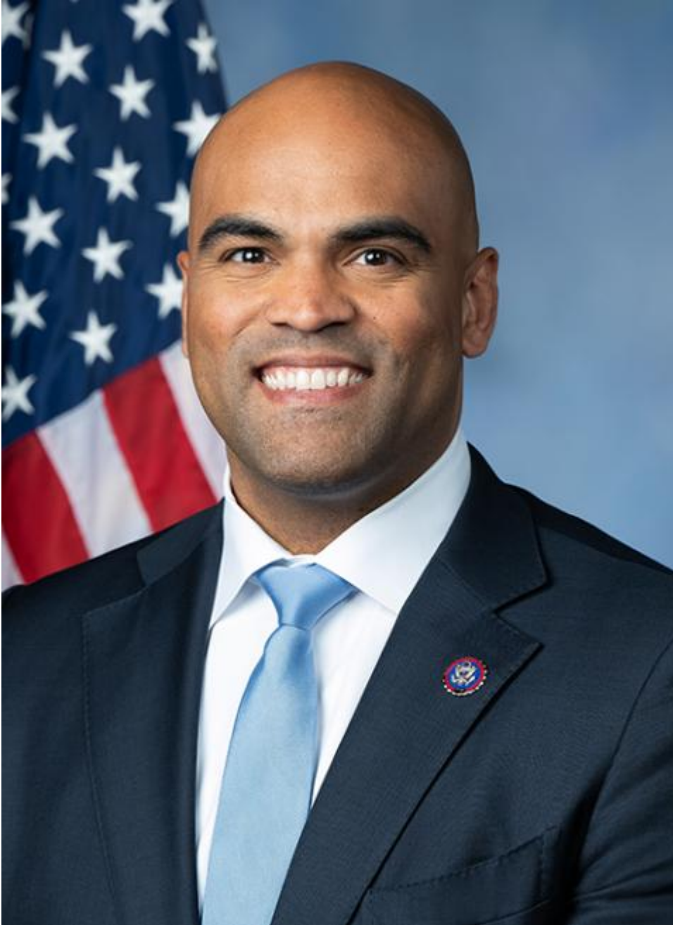
Official portrait of Rep. Colin Allred