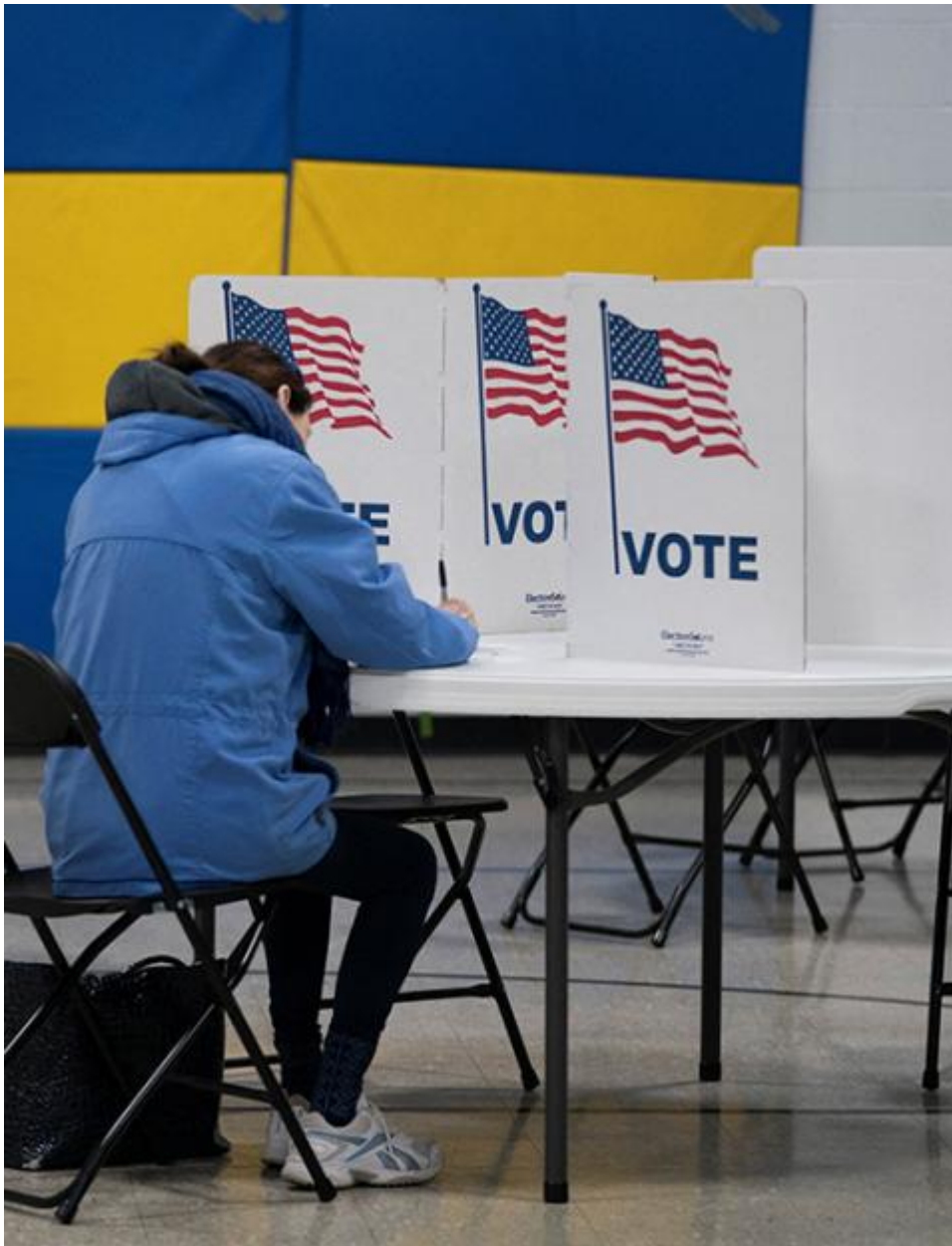
A woman prepares to vote in the presidential primary election at a polling place April 2 in Superior, Wisconsin.

Overall, Catholic voters in battleground states are motivated by pocketbook issues, with three of every four respondents saying the economy was the most important issue to them in this election. Other top issues were immigration/the border (60%), health care (53%), taxes (52%), affordable housing (46%), fighting crime (42%), gun control/Second Amendment rights (41%) and abortion/reproductive rights (37%).