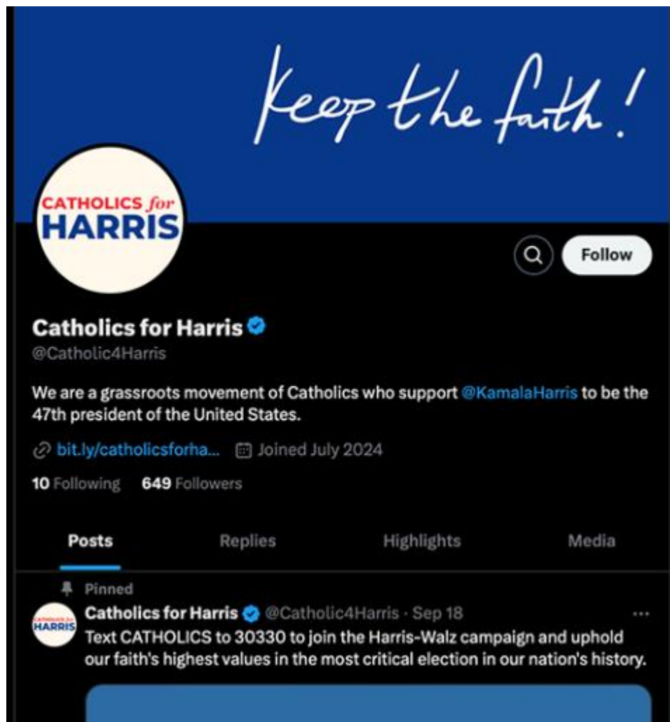
A screenshot of the Catholics for Harris account on X