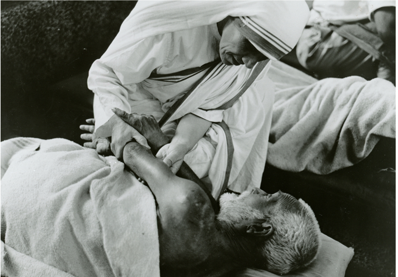
Mother Teresa of Kolkata cares for a sick man in an undated photo.

Opinion Guest Voices Column Spirituality