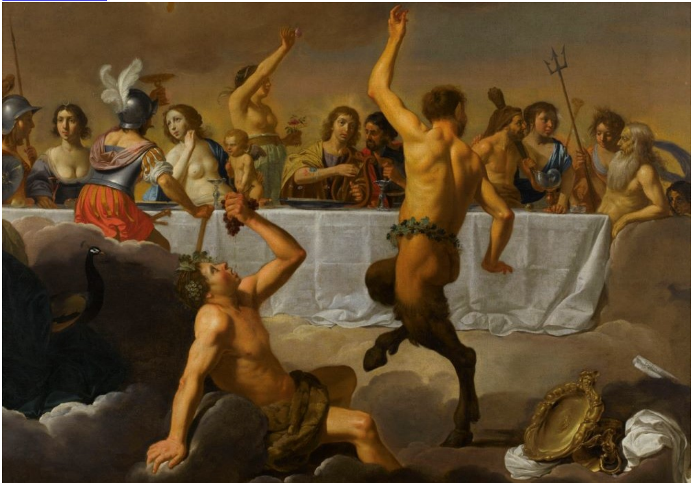
A portion of "The Feast of the Gods" (circa 1630) by Jan Harmensz van Biljert