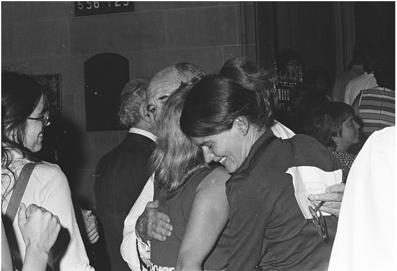
Congregation members respond to the ordinations at Church of the Advocate, July 29, 1974, in Philadelphia.