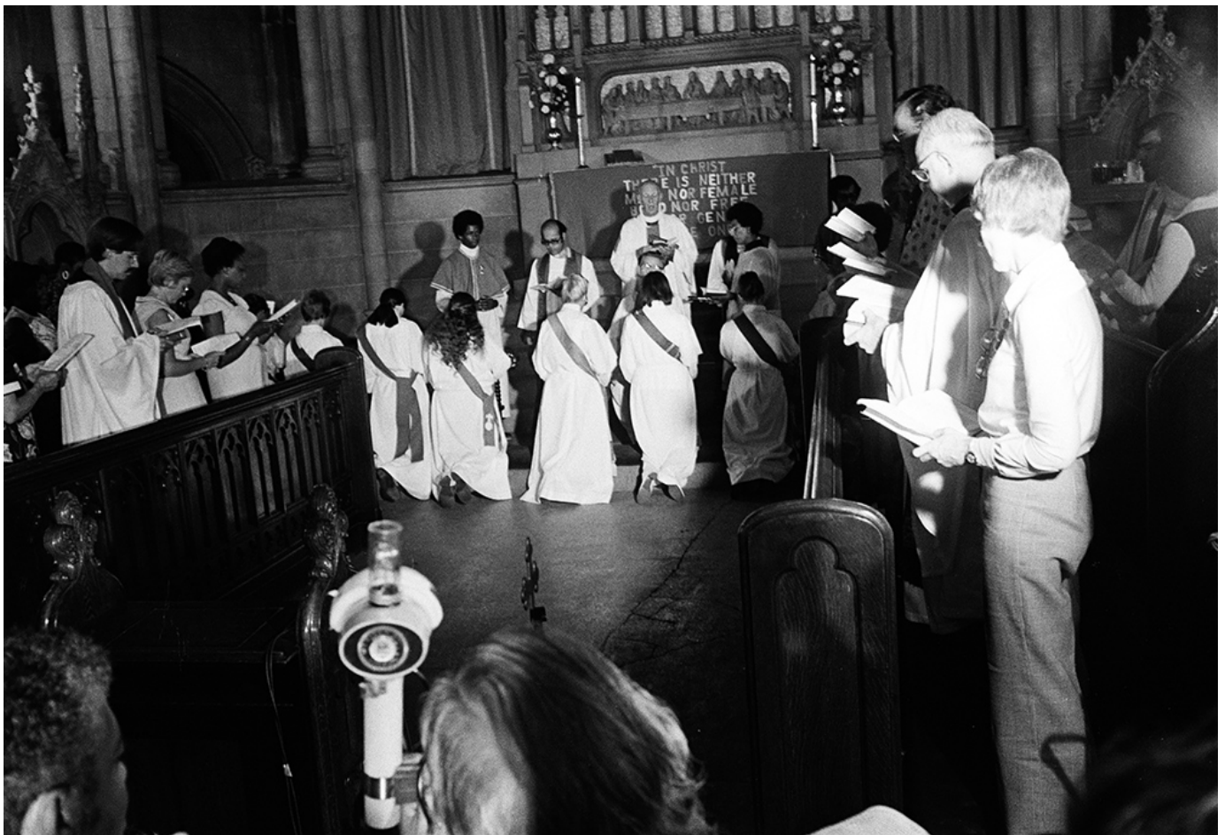
Jeannette Piccard kneels in the center, third from right, during the ordination service at Church of the Advocate, July 29, 1974, in Philadelphia. Piccard was ordained to

In her autobiographical notes held at the Library of Congress, Jeannette wrote, "With virtue drip[ping] from their lips," the society "would have nothing to do with sending a woman and a mother on so dangerous an expedition!" About her decision to pilot the balloon, she added , "When one is a mother ... one does not risk life for a mere whim. One must back up emotions by cold reason. One must have a cause worthy of the danger. In times of war one sacrifices self and children for country. In times of peace the sacrifice is made for humanity."