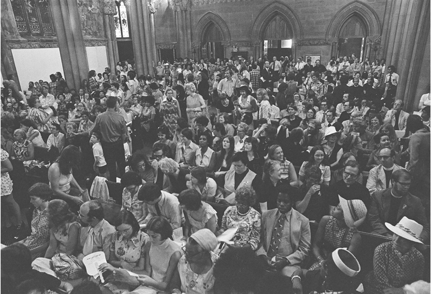
The congregation is pictured attending the ordination of 11 women priests at Church of the Advocate, July 29, 1974, in Philadelphia.

Carolina, Northwestern, the University of Chicago, Union Theological Seminary, Cornell and Episcopal Divinity School, they were considered by their opponents as improper matter for ordination. Might as well ordain a piece of wood or a rock or even a monkey in a tree as to ordain a woman, their detractors argued. And because the women could not and would not know their place within the church hierarchy, they were blamed for tearing the church apart and for taking it down the inescapable road of schism.