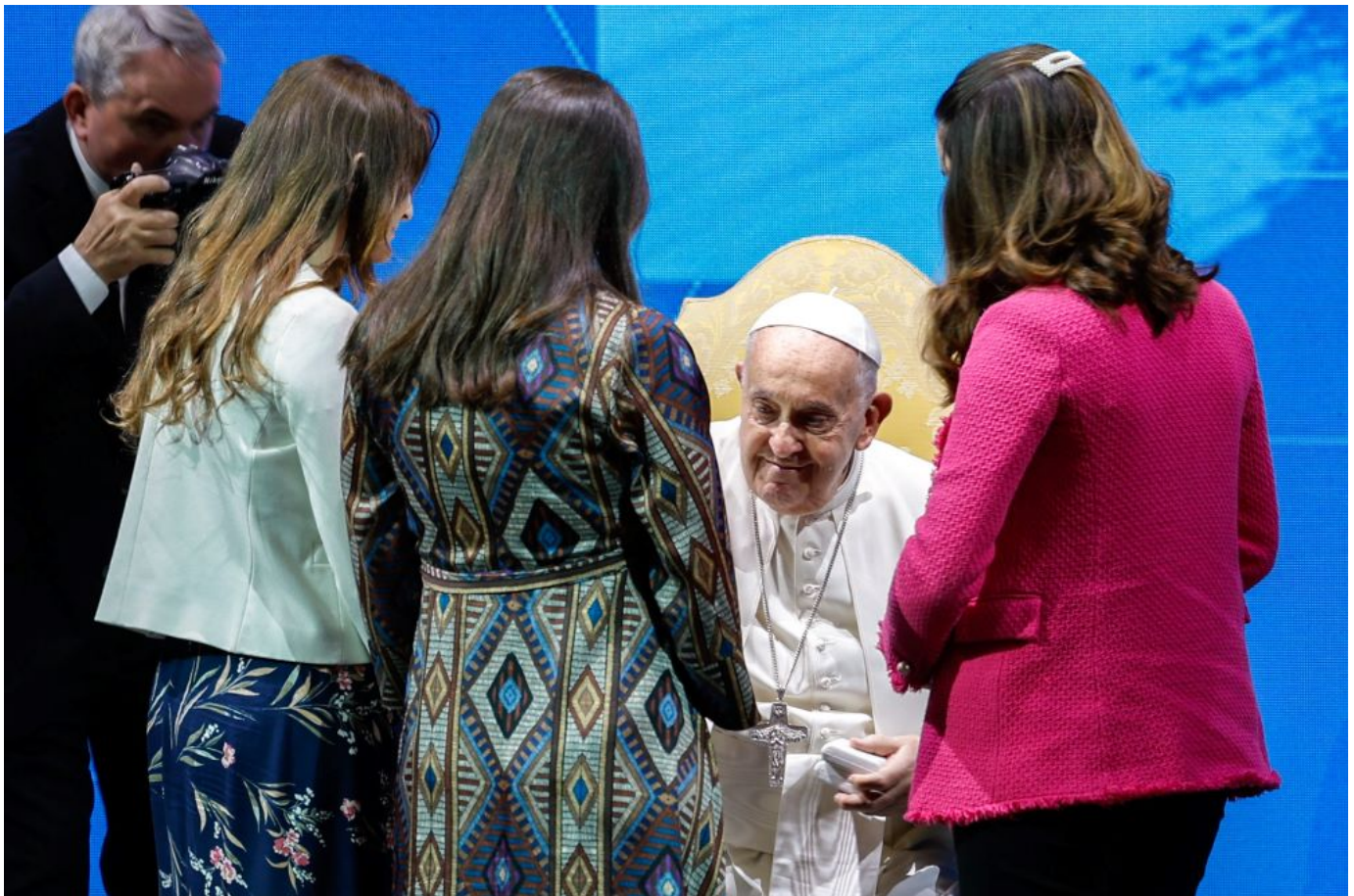
Pope Francis blesses three pregnant women at an annual meeting on Italy's declining birthrate at an auditorium in Rome May 10.