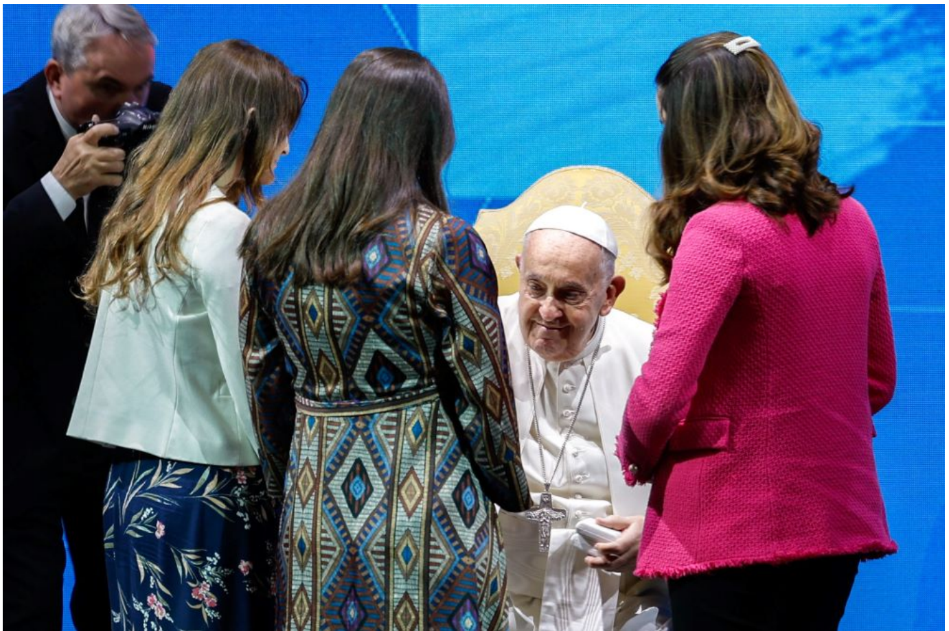
Pope Francis blesses three pregnant women at an annual meeting on Italy's declining birthrate at an auditorium in Rome May 10.