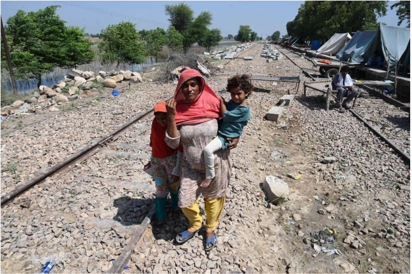
A pregnant flood-affected woman carries her child as she walks near her tent at a makeshift camp along a railway track in India's Punjab province in September 2022.

While research has established the link between heat and preterm birth, the next steps are to figure out how it happens in the body, and more importantly, how to prevent it.