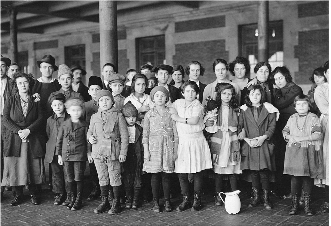
Immigrant children at Ellis Island in New York, 1908