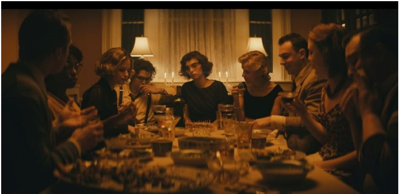
A scene from "Wildcat," directed by Ethan Hawke and starring Maya Hawke.

For O'Connor, writing was such a cathartic experience, a "plunge into reality" and the difficult part came when she had to advertise her work. Making "Wildcat" was such a personally enriching and fulfilling experience between you and Maya — but the marketing and publicity is harder. Will self-promotion always be the price creatives have to pay when making art for the public, or do you think there's a better way?