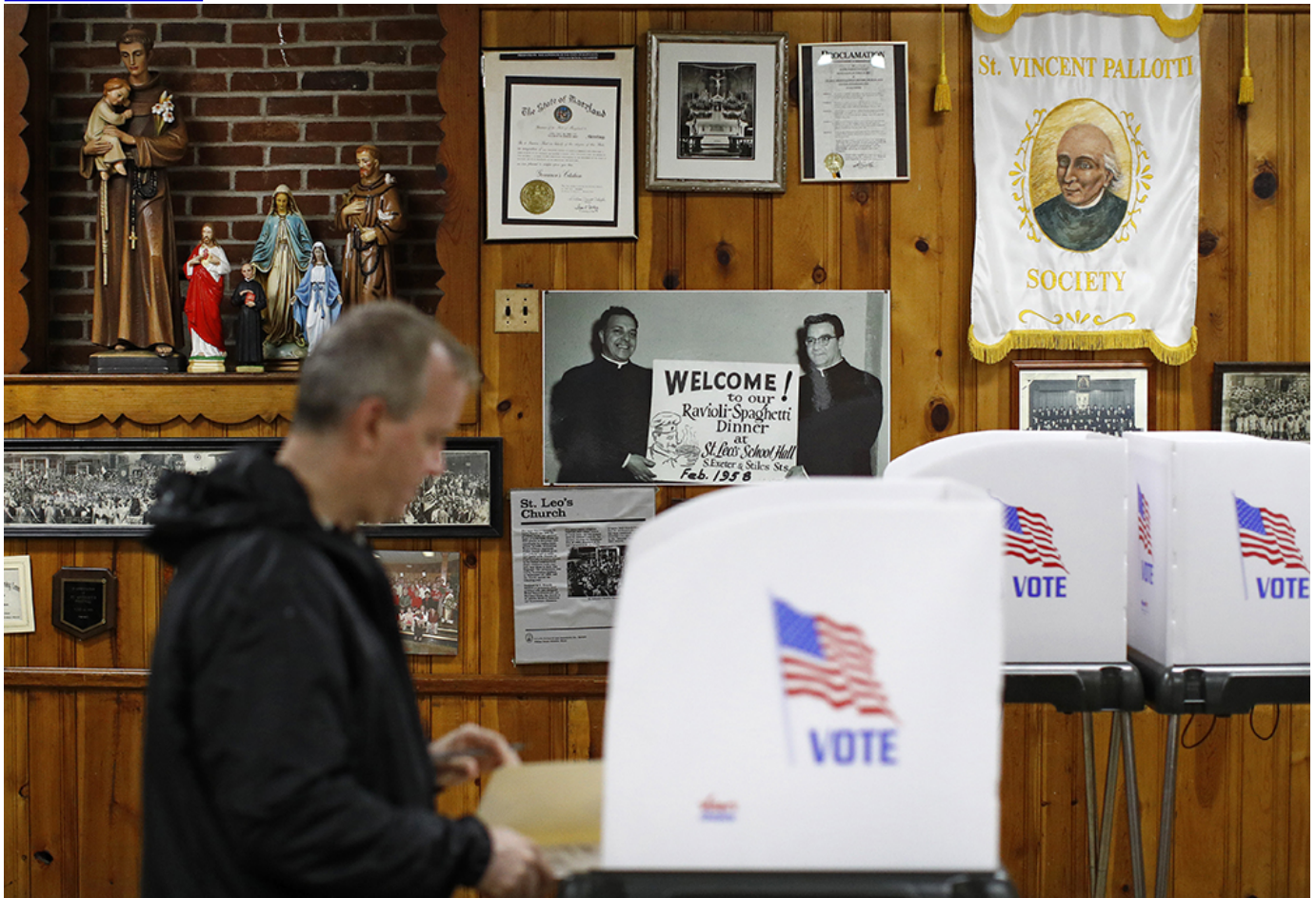
Religious artwork and vintage photographs adorn a wall behind a voter as he completes his ballot at a polling place inside St. Leo the Great Roman Catholic Church, Nov. 6, 2018, in Baltimore.