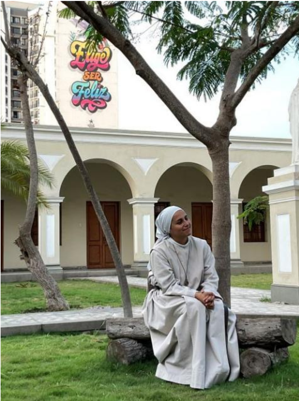
A sister prays in the cloister of the Monastery of the Incarnation in Lima, Peru.

our own way of understanding existence, to each his own. It is possible to live with the sole pretension of fulfilling oneself, of gaining well-being or power or fame; or to live in pursuit of the comfort of a life with few surprises and, at the same time, with some emotions that embellish it.