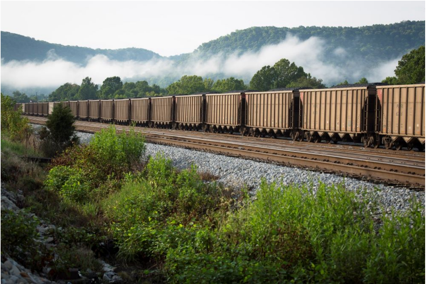
A train carries coal near Ravenna, Kentucky, Aug. 21, 2014.