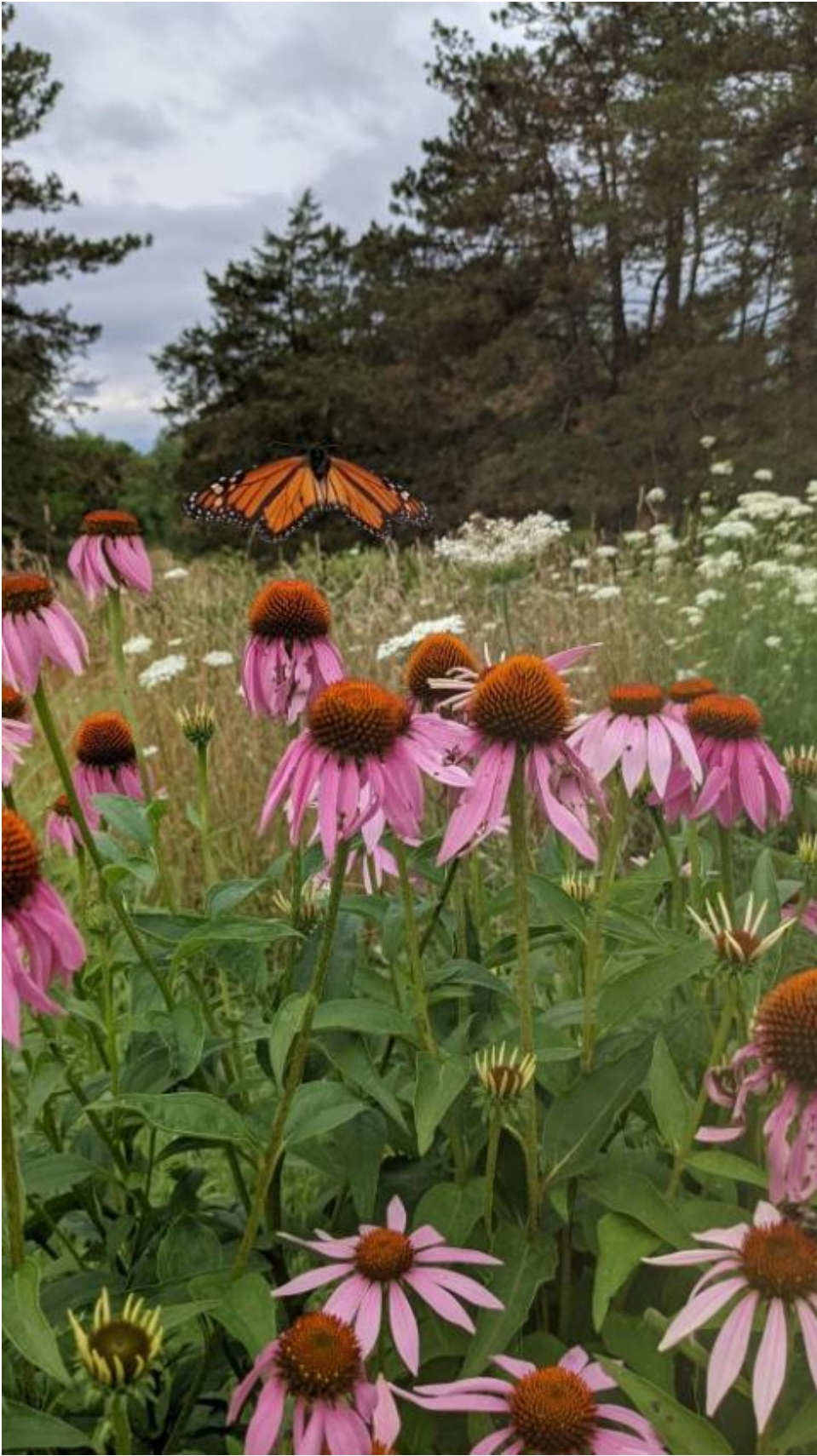
Flowers: In addition to land for farming, the Dominican sisters' property at Sinsinawa includes 10 acres of prairie and 10 acres of oak savanna. (Courtesy of Laurana