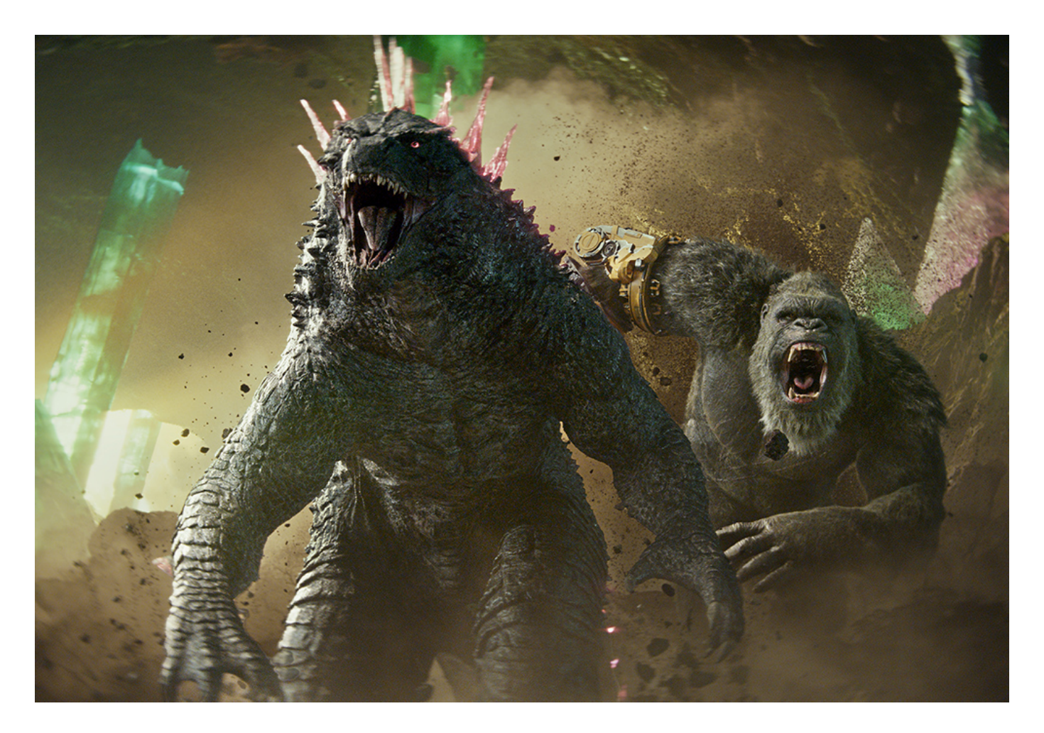
Godzilla and Kong in "Godzilla x Kong: The New Empire"

"Godzilla x Kong" simply does away with all the self-importance of its predecessors. Yet, in doing so, the film provides a surprisingly pointed answer to the question at the heart of every Godzilla film: What if this were real?