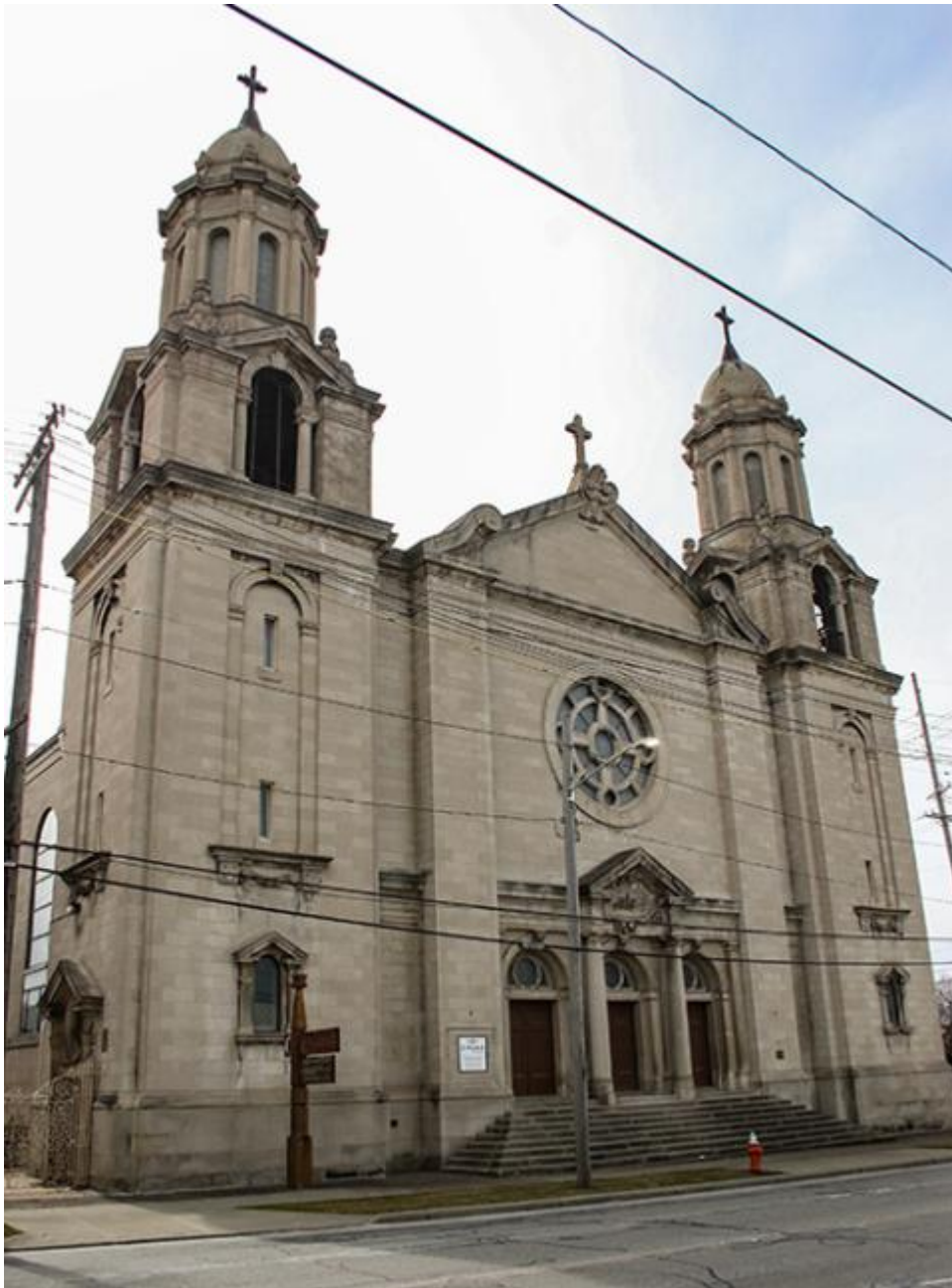
St. Elizabeth of Hungary Church in Cleveland