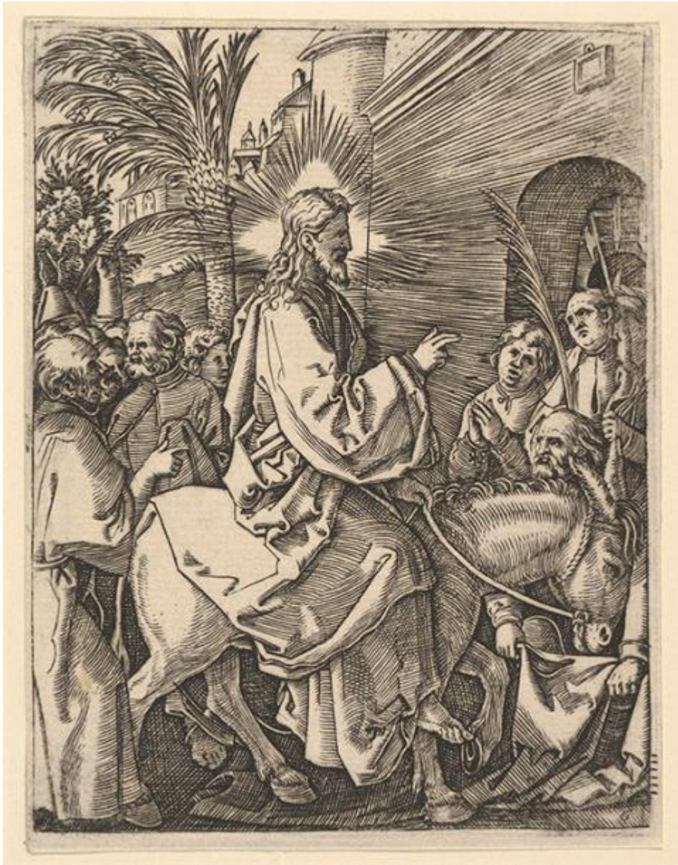
"The Entry into Jerusalem; Christ riding on a donkey towards an arched city gate; an elderly man spreads out his cloak on the road," from "The Passion of Christ", after Dürer, circa 1500-34 by Marcantonio Raimondi (Metropolitan Museum of Art)

And because Christ is at the heart of all of creation, we can say that it is not only Easter but all of Holy Week that has significance for more than just humanity alone.