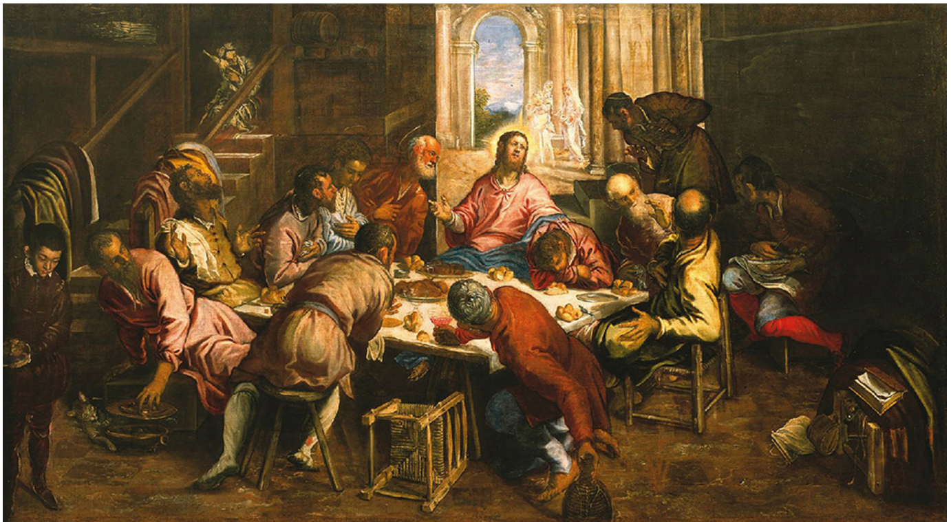
This photo represents Renaissance painter Tintoretto's "The Last Supper."

What about Holy Thursday? The institution of the Lord's Supper — what the Second Vatican Council called the "source and summit" of our faith — is fundamentally about a meal shared by Jesus Christ with those women and men closest to him. They took "fruit of the earth and work of human hands," as our eucharistic prayer reminds us, and consumed it as we do all food.