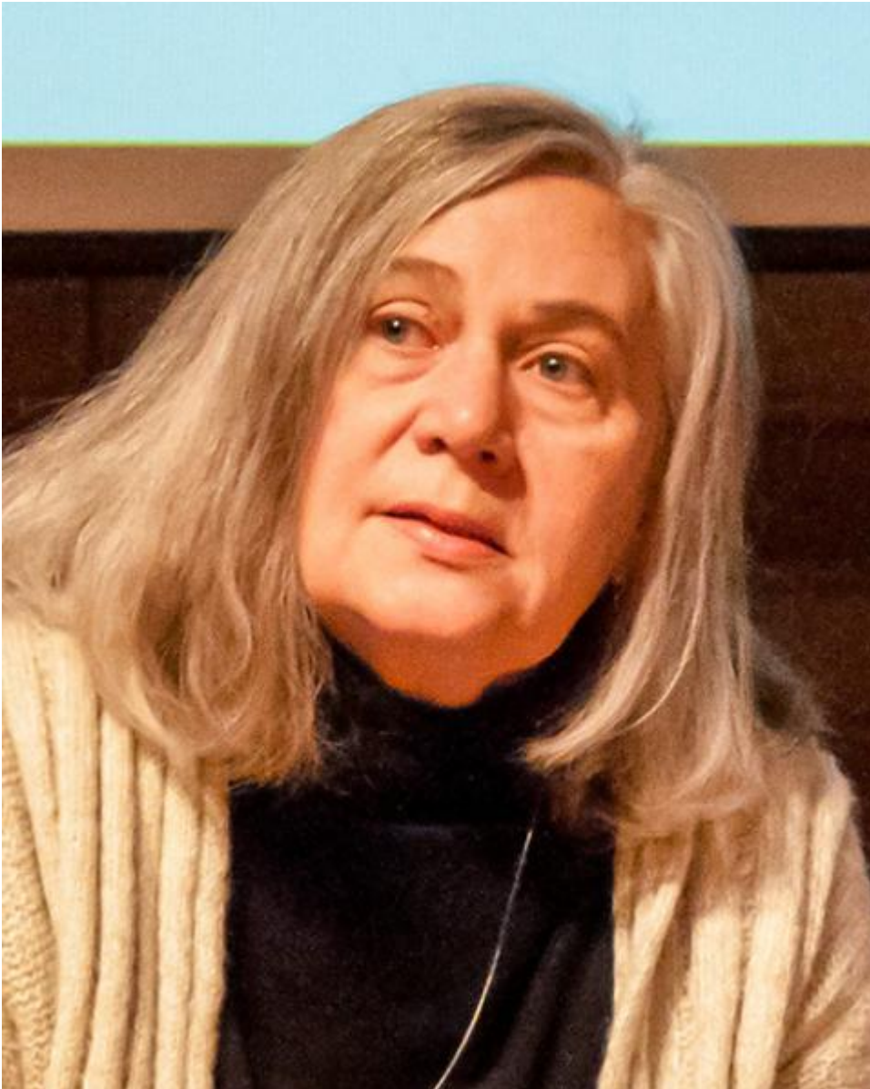
Marilynne Robinson

We are not merely reading Genesis (although we can: the book includes the full text of the King James Version). We are reading Genesis with Marilynne Robinson , watching her mind at work on the page, and what a mind to help us understand this great but often opaque literary and theological tome. Reading Genesis is a retelling of the stories in the book of Genesis, with Robinson's astute, gracious and sometimes sly commentary.