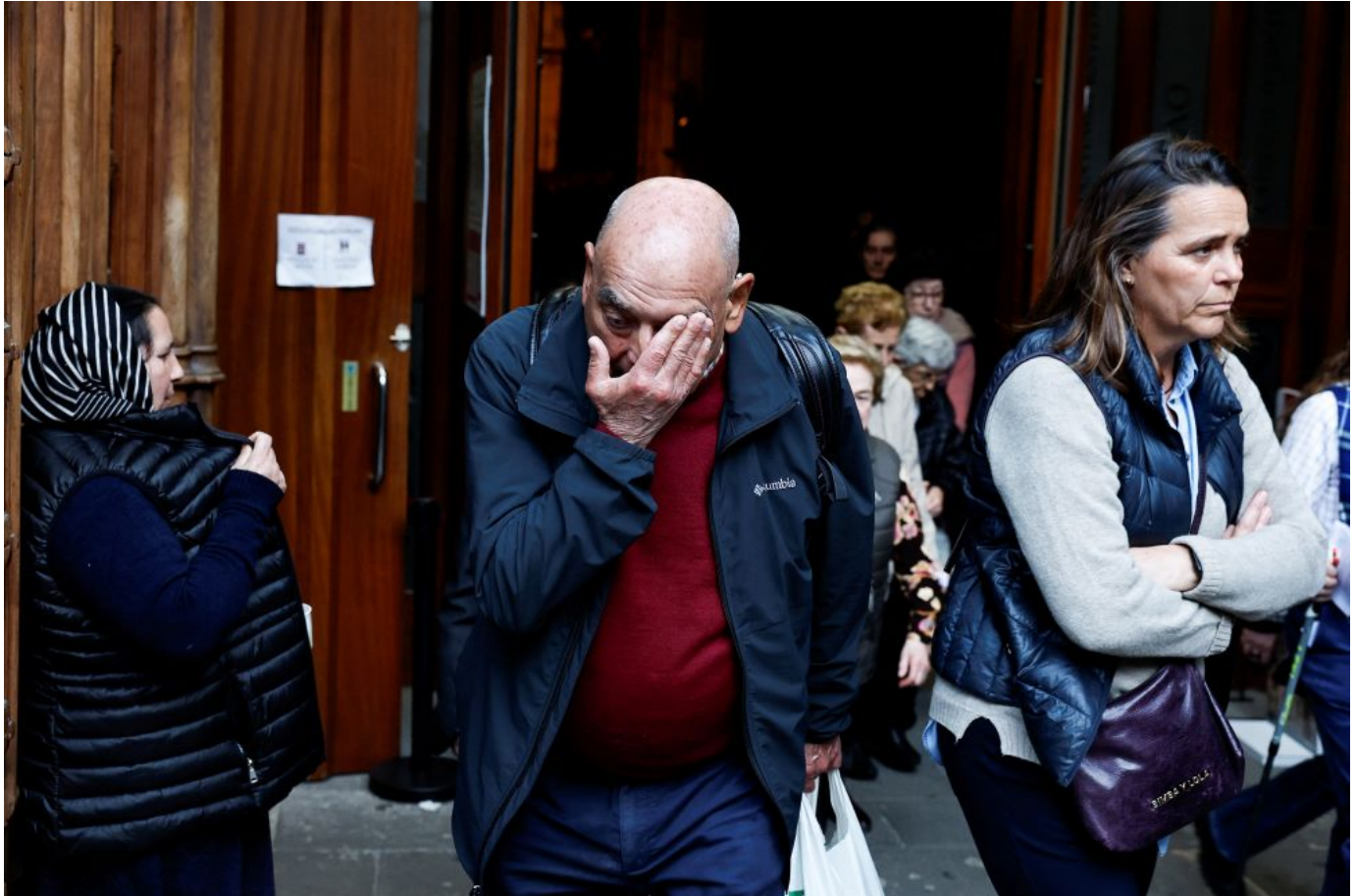
A man reacts while leaving a Mass at Santiago Cathedral in Bilbao, Spain, March 24, that was celebrated to recognize and apologize to victims of sexual abuse within the Catholic Church.

disconnect between man-made canon law and the inalienable human rights which are an embedded function of the natural law, or what believers would call God-ordained individual human dignity. But the people of God have confronted the disconnect in increasing numbers, and confidence is waning in an arcane autocratic government populated exclusively by ordained men who are compulsorily celibate.