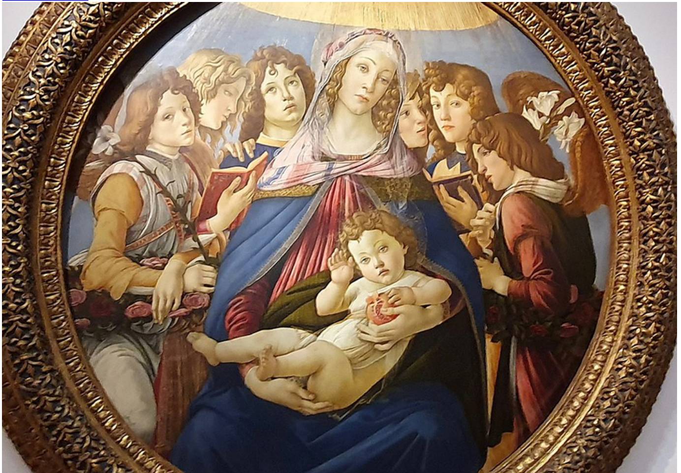
"Madonna of the Pomegranate" or "Virgin and Child with the Angels" was painted by Sandro Botticelli circa 1487 and is now housed in The Uffizi Gallery in Florence, Italy.