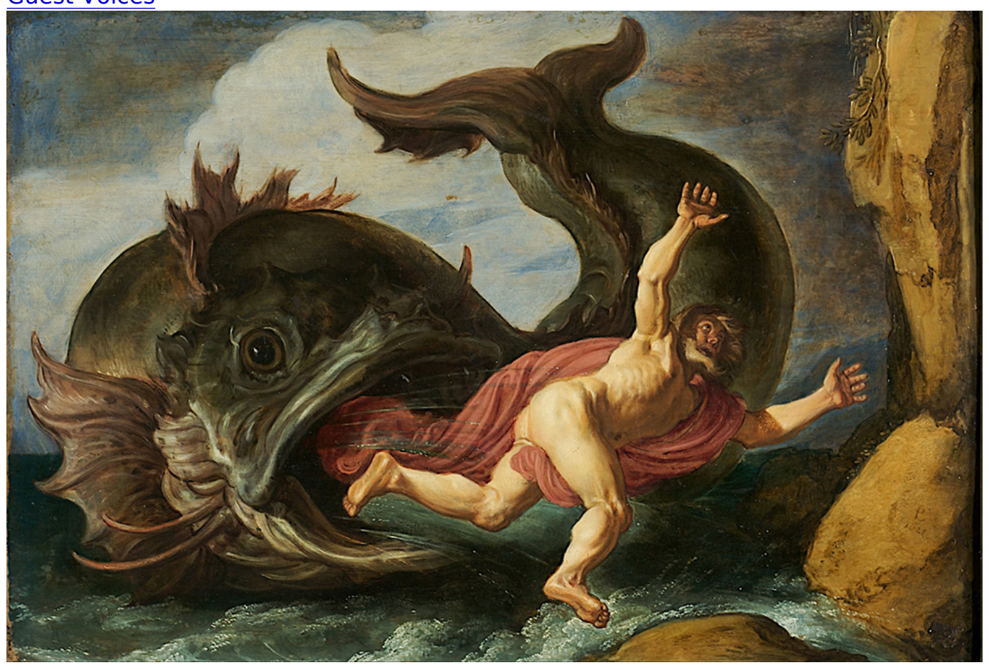
"Jonah and the Whale" (1621) by Dutch painter Pieter Lastman