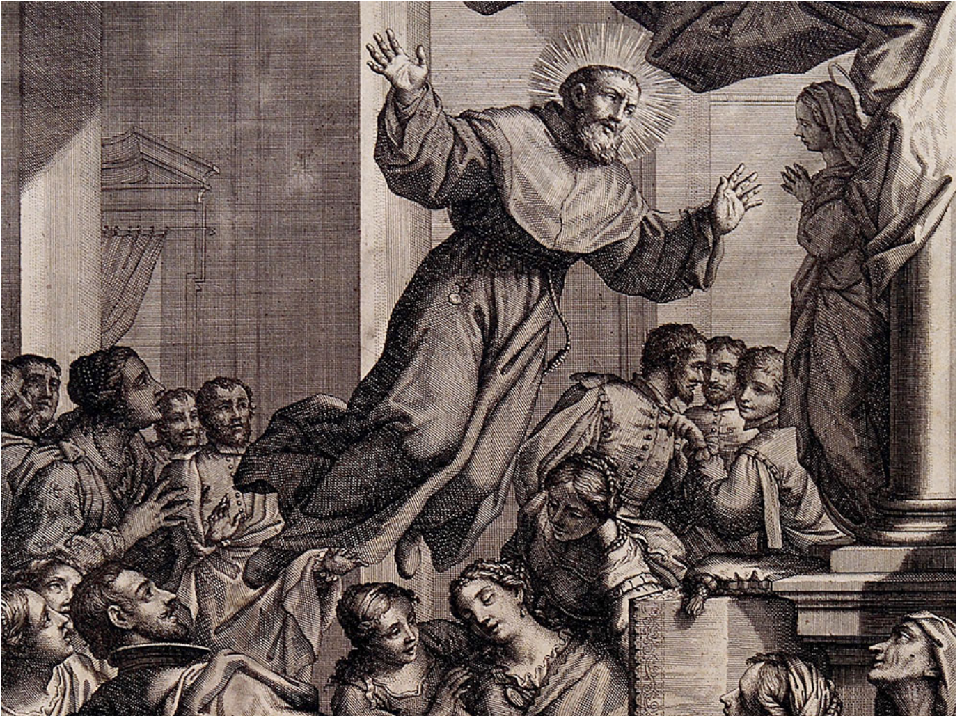
St. Joseph of Cupertino is depicted levitating in an 18th-century engraving by G.A. Lorenzini.