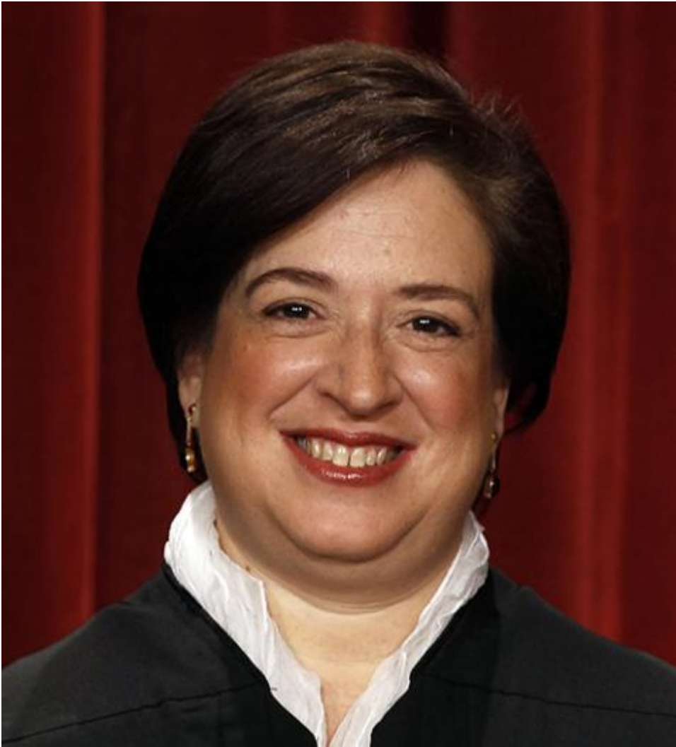
Justice Elena Kagan

Policy is equal parts law and facts. Law contains many components: the will of the people, national ideals, historic constitutional precedents, promises made on a campaign trail, etc. Facts are more particular and stubborn things. Or should be.