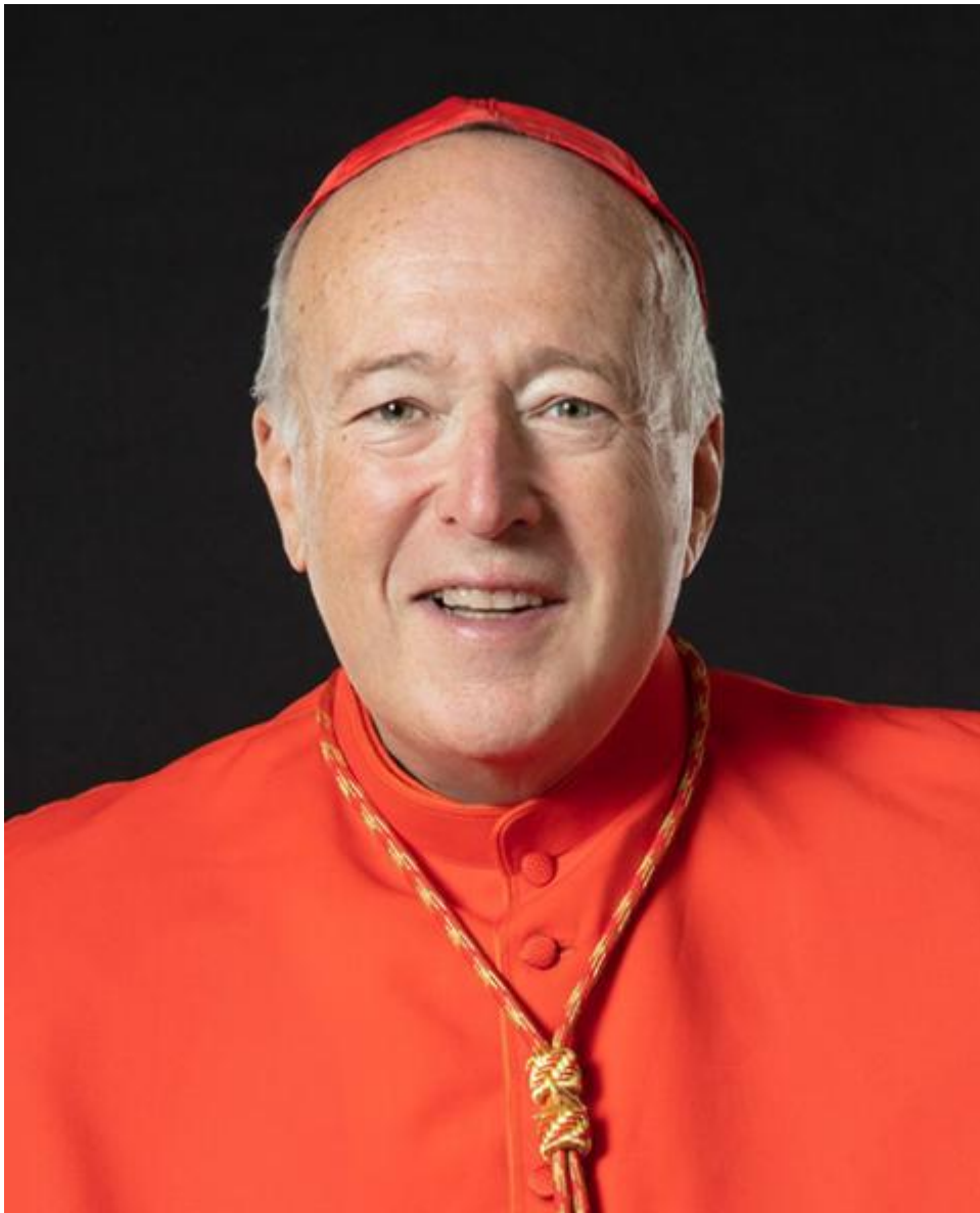
Cardinal Robert McElroy

How can a government, or a civilization for that matter, prosper if it believes all knowledge is relative? If it is not willing to wrestle with the reality of things? Certainly, our climate has no hope if we dismiss the objective reality staring us in the face.