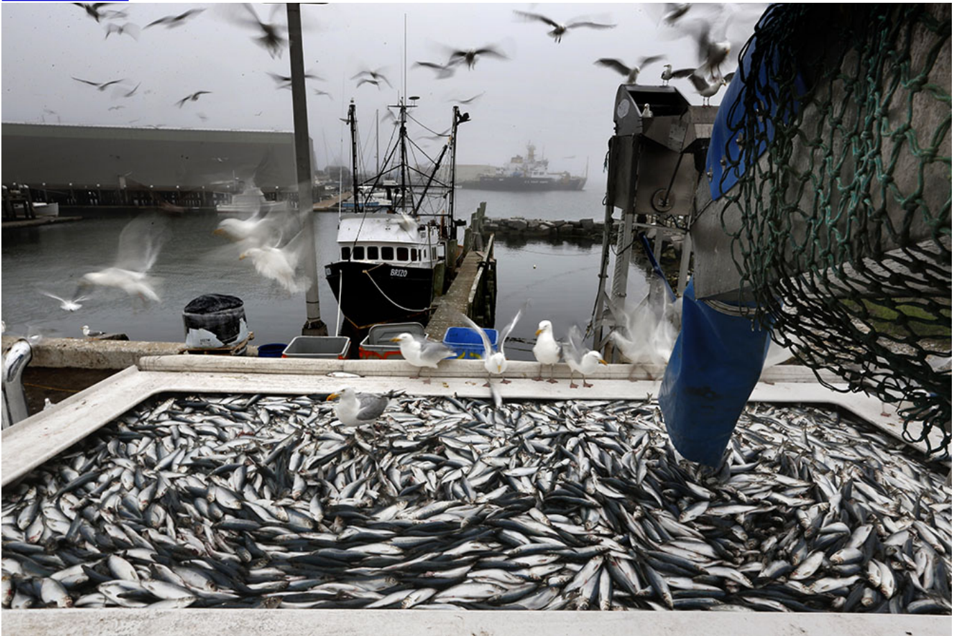
Herring are unloaded from a fishing boat in Rockland, Maine, July 8, 2015.