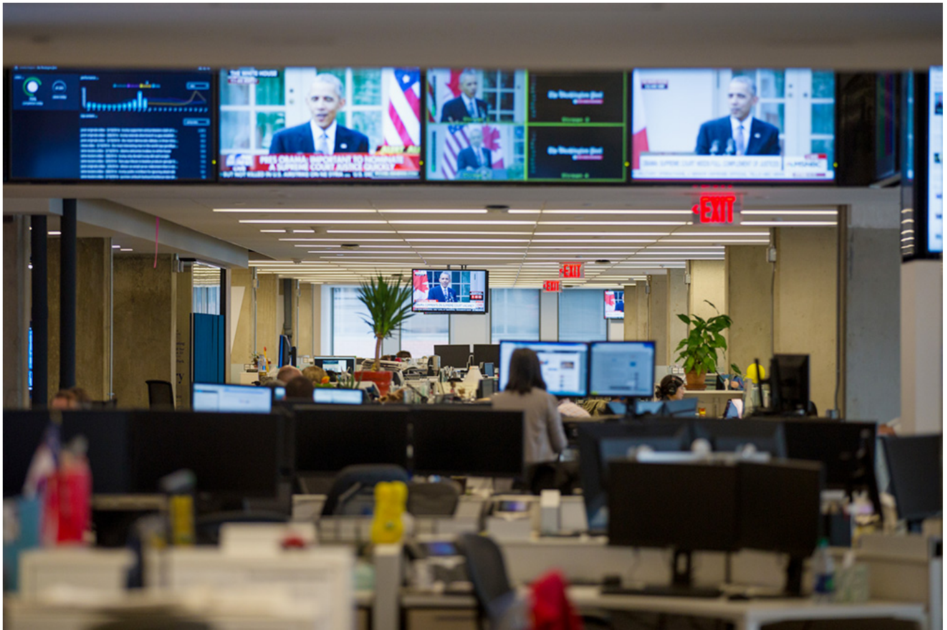
A view of the Washington Post newsroom in Washington, D.C., in spring 2016

Baron says issues involving diversity and social media caused growing fissures between him and his staff. As much as he'd hardened himself to attacks by Trump and others complaining about coverage, he says, "the invective leveled against me by colleagues — whose skill and bravery I admired and whose news organization I had busted my butt for eight years to turn around — was tougher to take. Nothing was more hurtful."