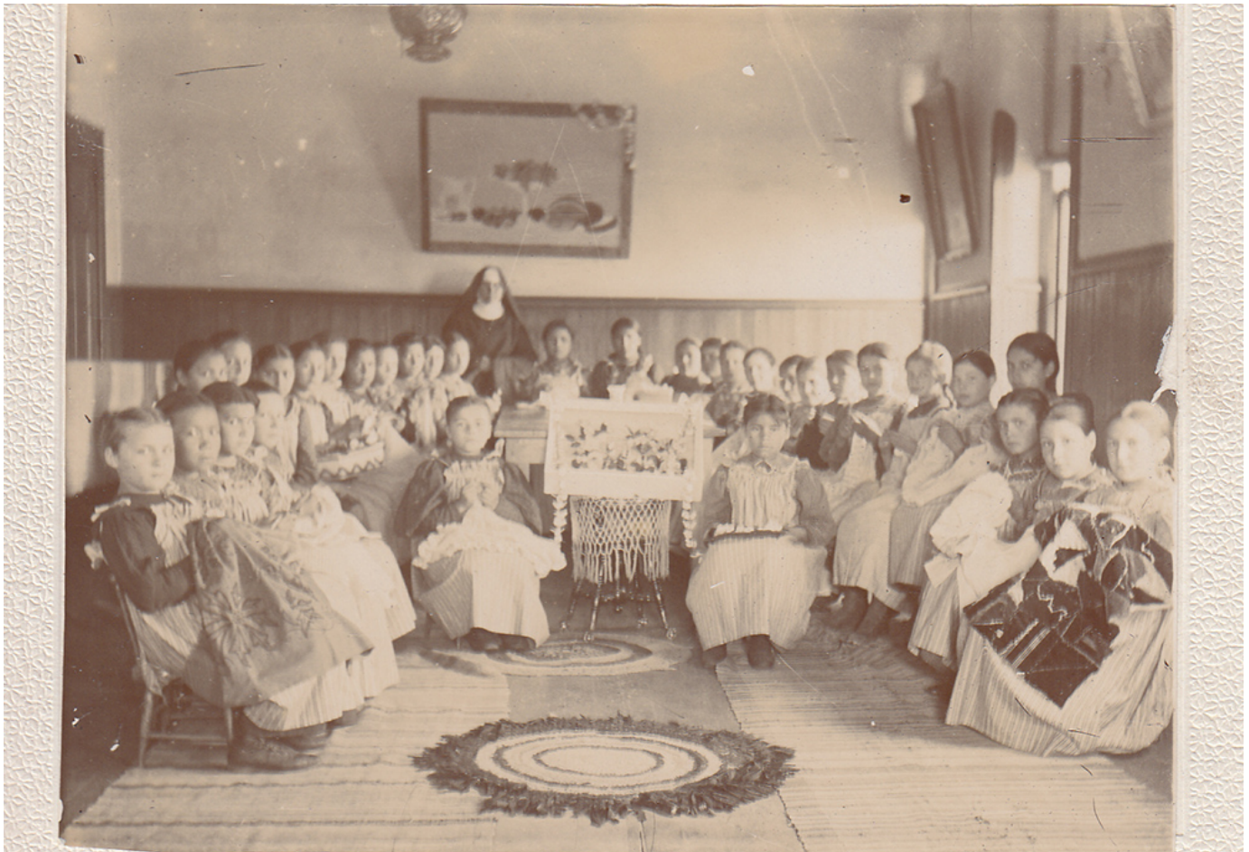
Female students show their handiwork at St. Benedict's Mission School on the White Earth Indian Reservation in Minnesota in the 1890s.

The series continued with a deeper look at the steps being taken toward reconciliation as recommended by the Truth and Reconciliation Commission and a closer look at Returning to Spirit , an Indigenous-led, not-for-profit group that was co-founded by the Sisters of St. Ann.