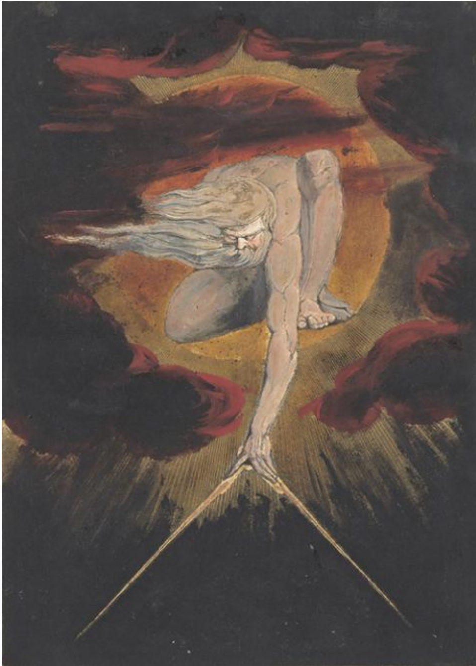
"The Ancient of Days," from "Europe a Prophecy," printed 1795, William Blake (British, 1757-1827), color-printed relief etching in dark brown with pen and black ink, oil, and watercolor

It was worth the wait. I've seen some of the works before, including at the Tate, but it was inspiring to see so many Blake works exhibited together.