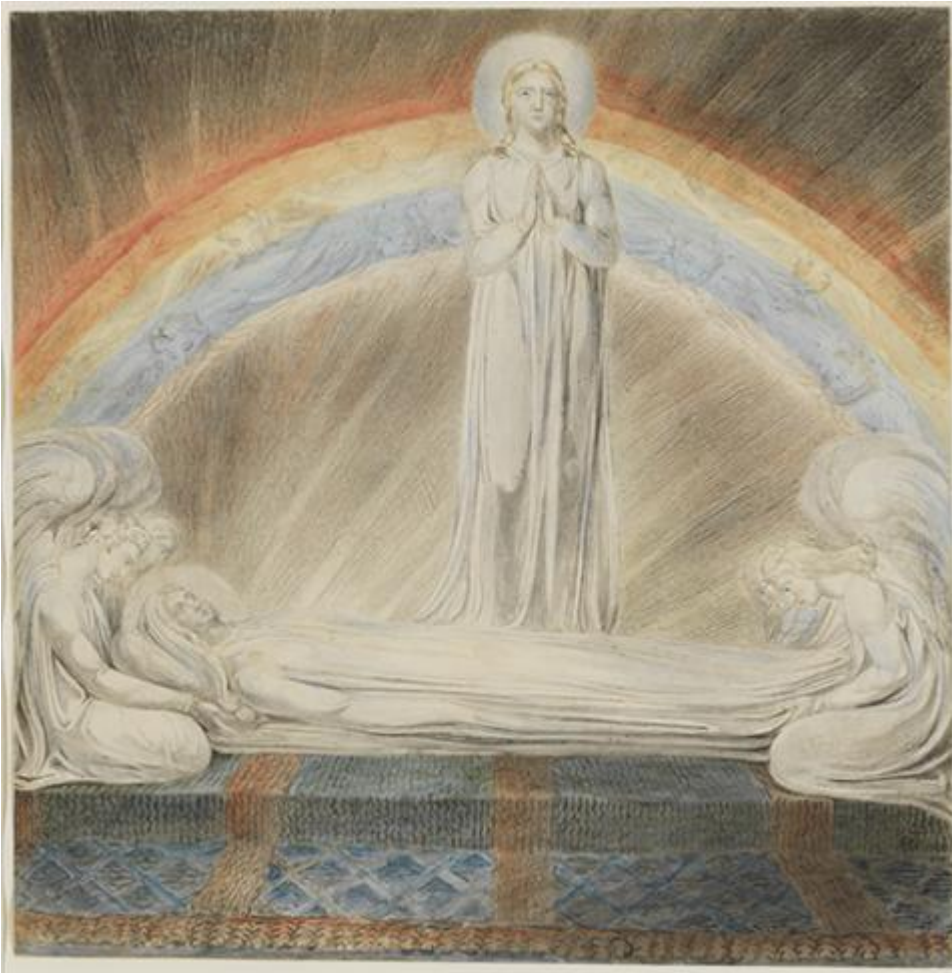
"The Death of the Virgin," 1803, William Blake (British, 1757–1827), watercolor

I find that a bit sad — no one can question Blake's talent and versatility in printmaking, tempera and watercolor, but imagine what he could have done had he embraced oil painting — and on the scale Turner so masterfully pulled off.