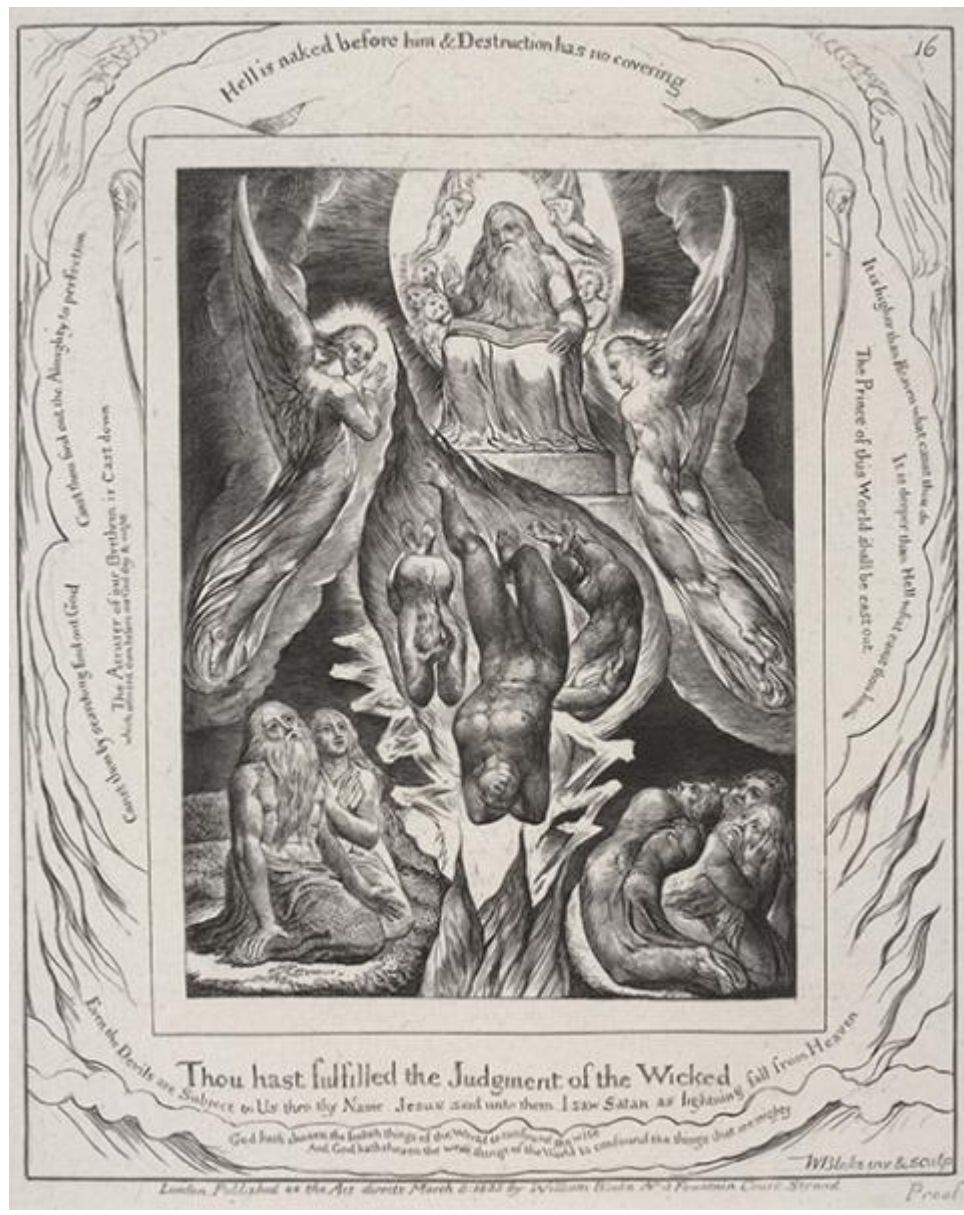
Plate 16 from "Illustrations of the Book of Job," printed 1825, William Blake (British, 1757-1827), engraving

To many, Blake was a forerunner of counterculturalism.