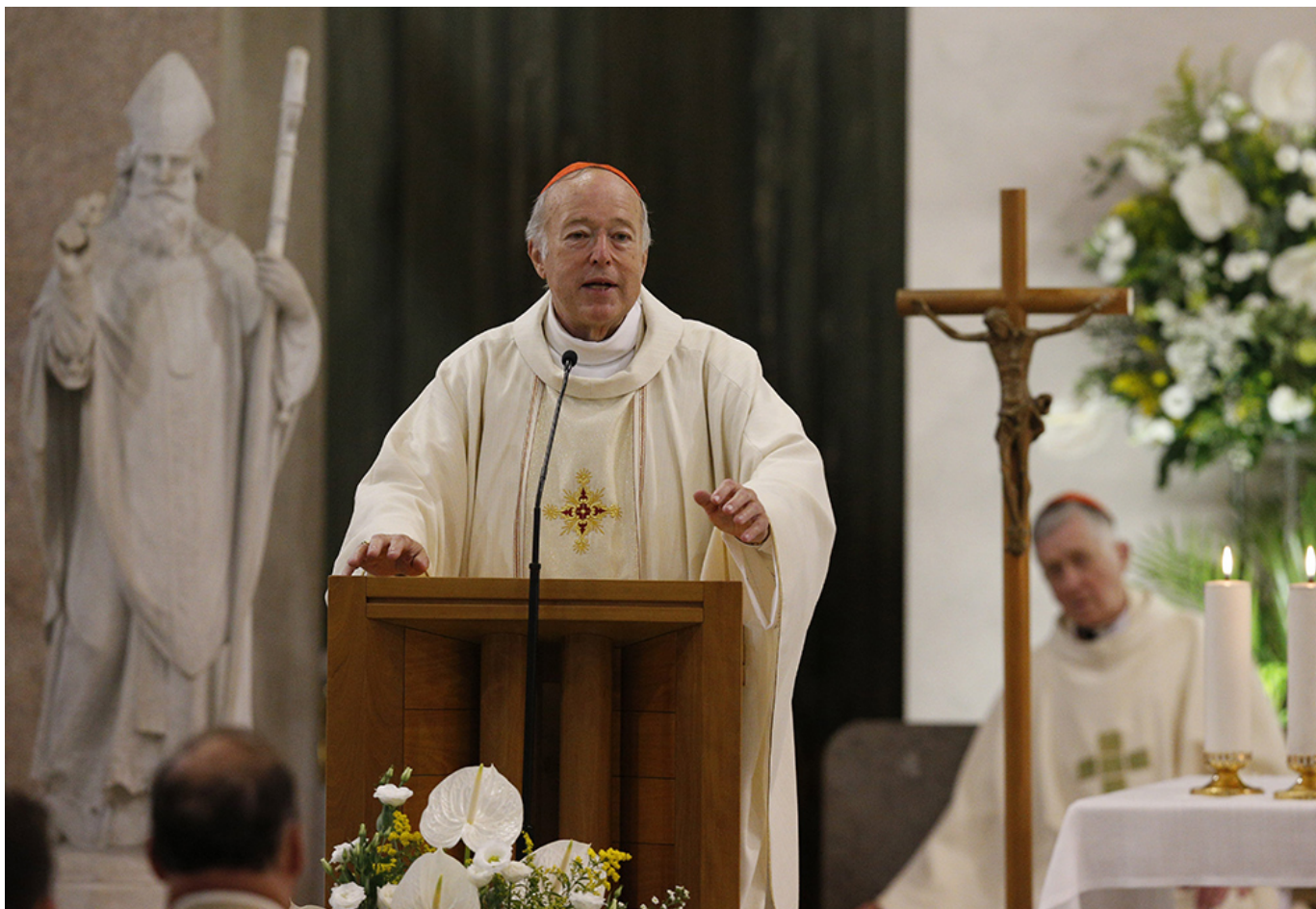
Cardinal Robert McElroy of San Diego gives the homily as he celebrates a Mass of thanksgiving at St. Patrick's Church in Rome in this Aug. 28, 2022, file photo.