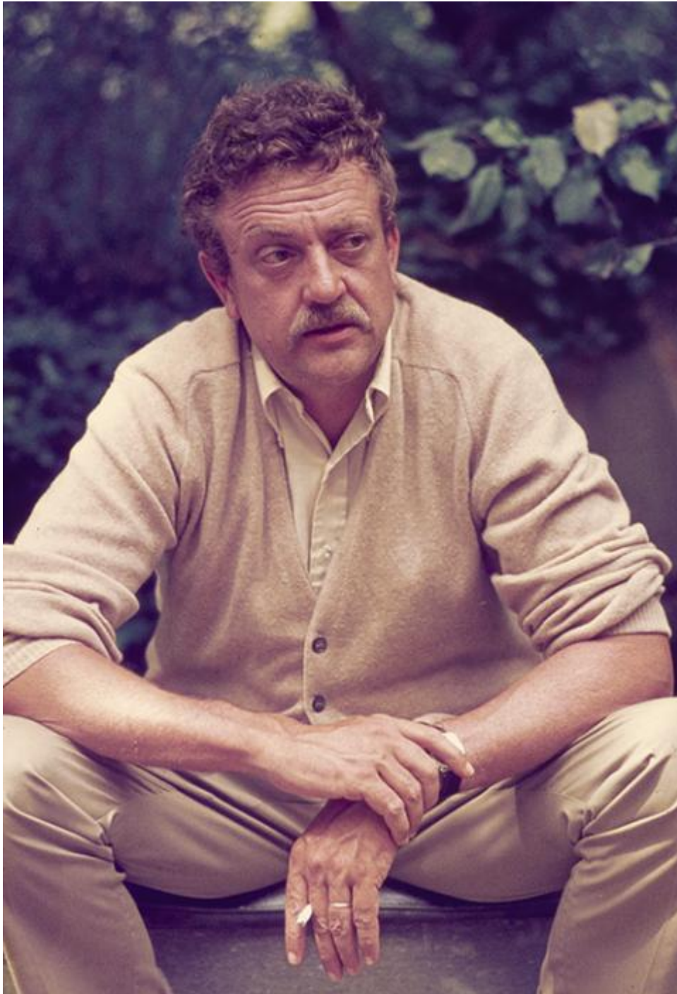
Kurt Vonnegut in 1965

For a page that featured the three shapes twisted together, Vonnegut wrote, "The Creator now saw a sun, a moon and a star come together in an impossible cosmic tangle. What could be the explanation? The baby's eyes had crossed."