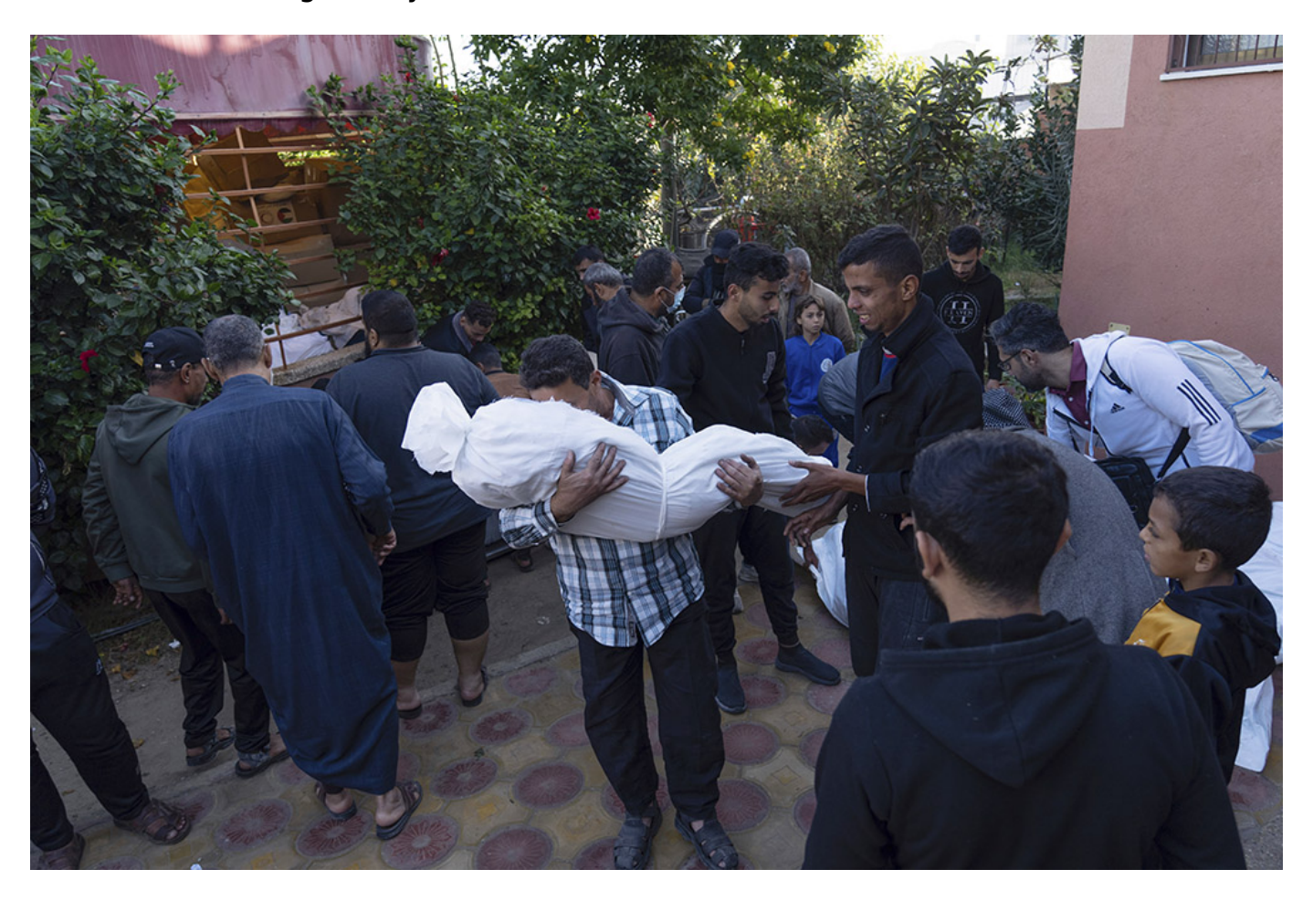
Palestinians mourn their relatives killed in the Israeli bombardment of the Gaza Strip Dec. 3.

mediate a just and lasting peace in the Holy Land, based on equal rights for all and on international legitimacy."