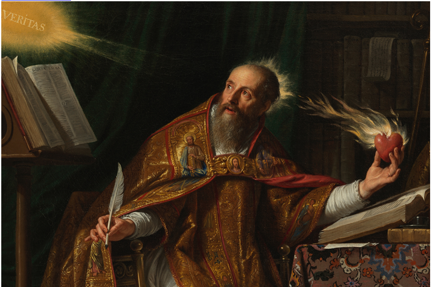
"Saint Augustine" (circa 1645), by Philippe de Champaigne