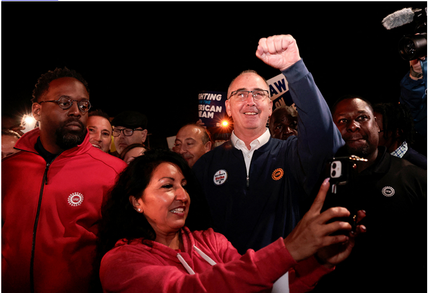
United Auto Workers union President Shawn Fain joins striking UAW members on the picket line at the Ford Michigan Assembly Plant, Sept. 15 in Wayne, Michigan.