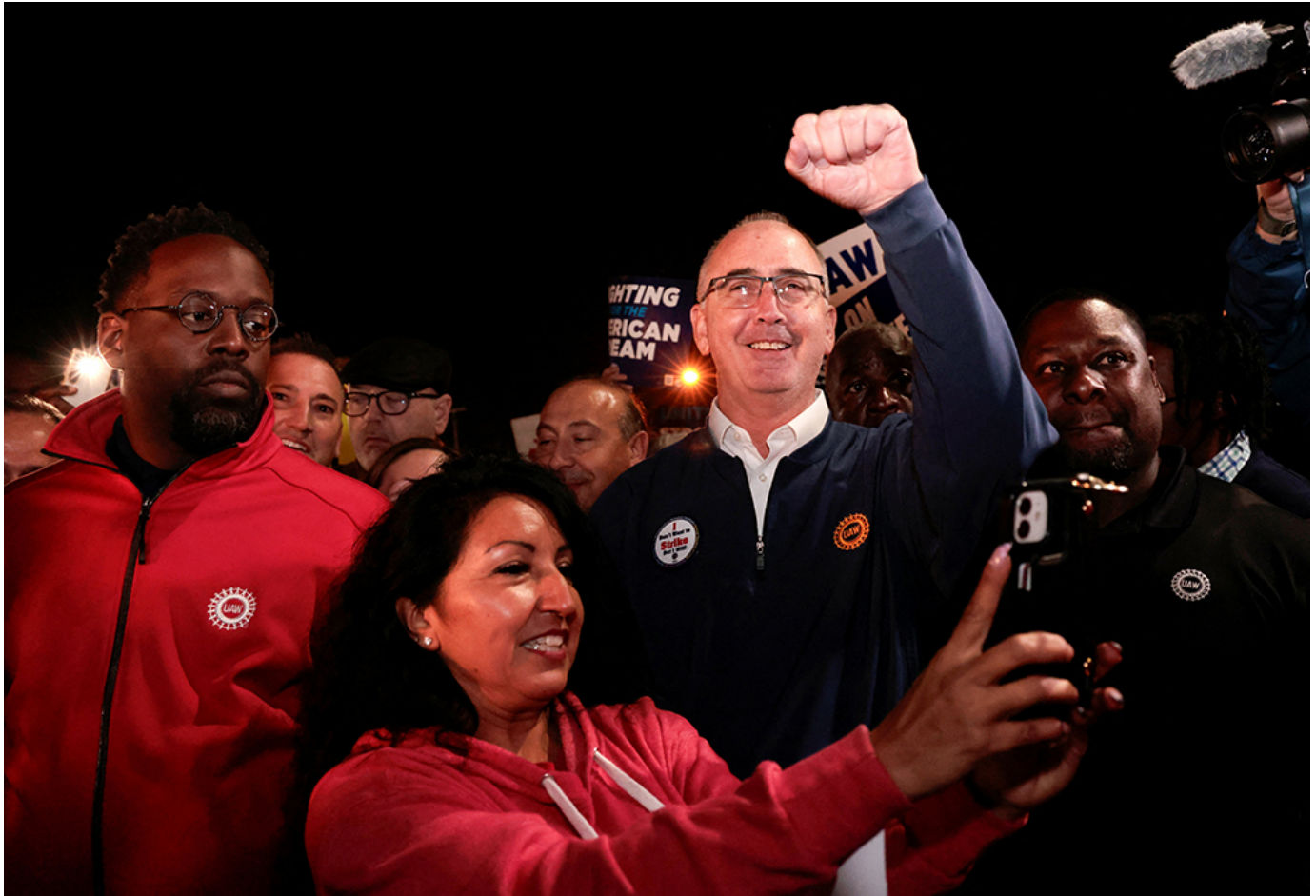
United Auto Workers union President Shawn Fain joins striking UAW members on the picket line at the Ford Michigan Assembly Plant, Sept. 15 in Wayne, Michigan.