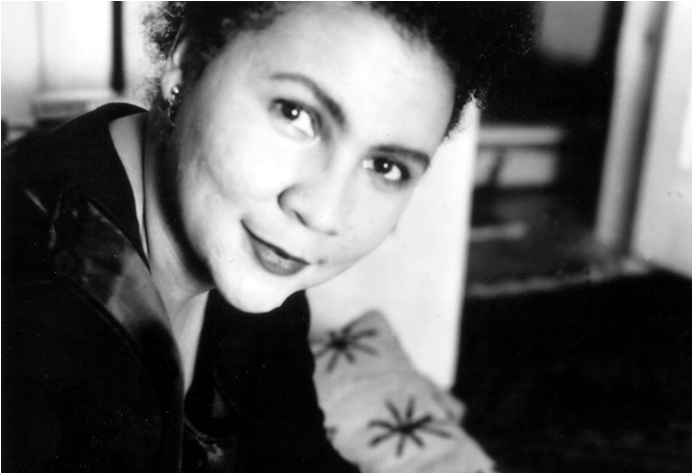
Author and social activist bell hooks

she coined — 'imperialist white supremacist capitalist patriarchy' — captured the interlocking forms of oppression that target them."