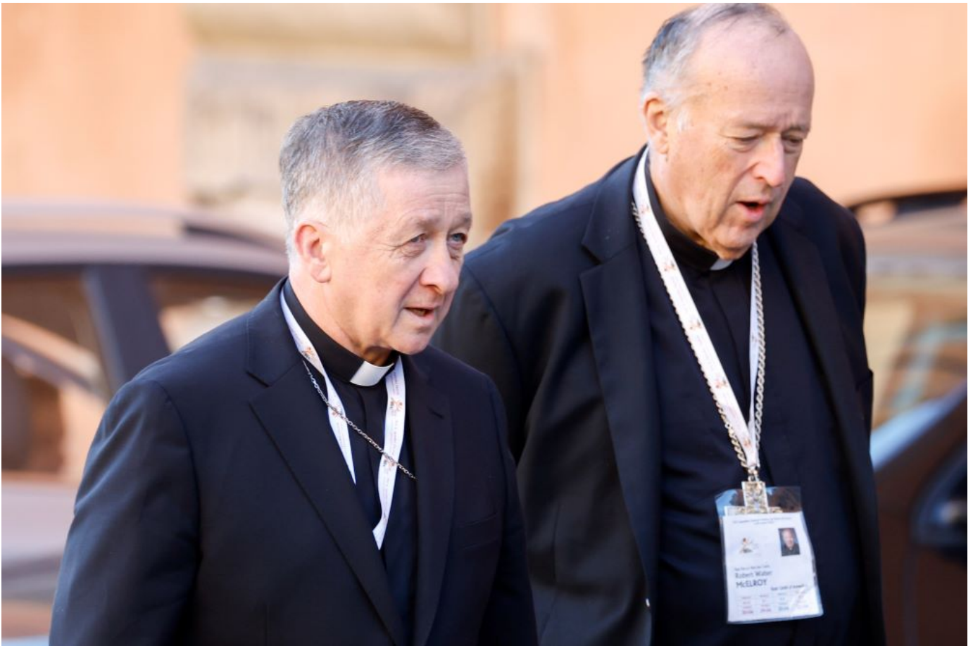
Cardinals Blase Cupich of Chicago (left) and Robert McElroy of San Diego arrive for a session of the assembly of the Synod of Bishops in the Vatican's Paul VI Audience Hall Oct. 17.

2. Synodality demands a willingness to change. We all tend to become set in our ways in a manner that limits our ability to authentically grow as disciples of Jesus Christ. Synodality calls us to overcome our complacency and remain actively engaged in the process of growth and sanctification that lies at the heart of discipleship.