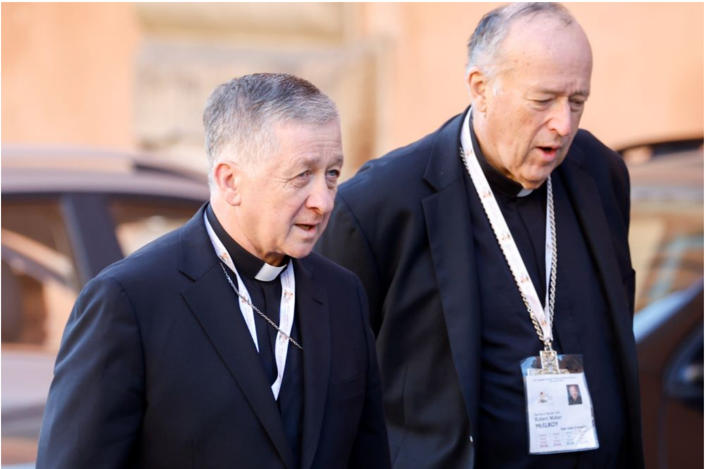
Cardinals Blase Cupich of Chicago (left) and Robert McElroy of San Diego arrive for a session of the assembly of the Synod of Bishops in the Vatican's Paul VI Audience Hall Oct. 17.

2. Synodality demands a willingness to change. We all tend to become set in our ways in a manner that limits our ability to authentically grow as disciples of Jesus Christ. Synodality calls us to overcome our complacency and remain actively engaged in the process of growth and sanctification that lies at the heart of discipleship.