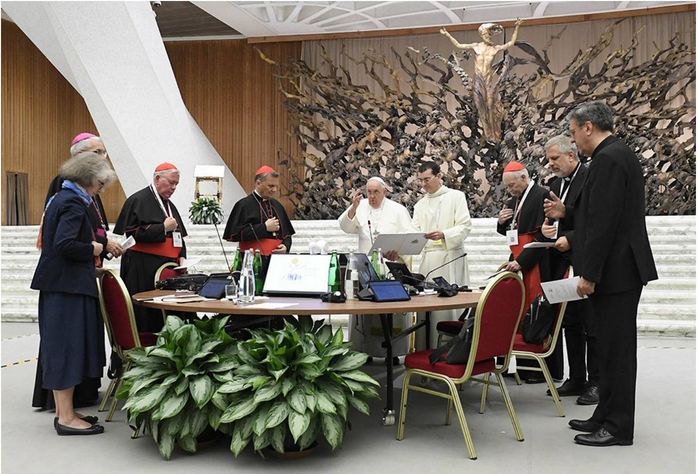
Pope Francis gives his blessing at the conclusion of the assembly of the Synod of Bishops' last working session Oct. 28, 2023, in the Paul VI Hall at the Vatican.

The Holy Spirit could not have stirred the heart of Pope Francis at a more urgent time, considering the division, intolerance, indifference, exclusion, and inequality in our world. Since the onset of the synod, there has been a profound conversion experience across various groups in my community, deeply impacting our core values and ideals in religious life, a witness of the Catholic Church in glory. The synod has called for an overhauling of the systems of operation within the church and her structures, while preserving the rich traditions and cultures that have stood the test of time. There is a great sense of hope that the conclusion of the general gathering of the synod delegates will yield abundant fruits.