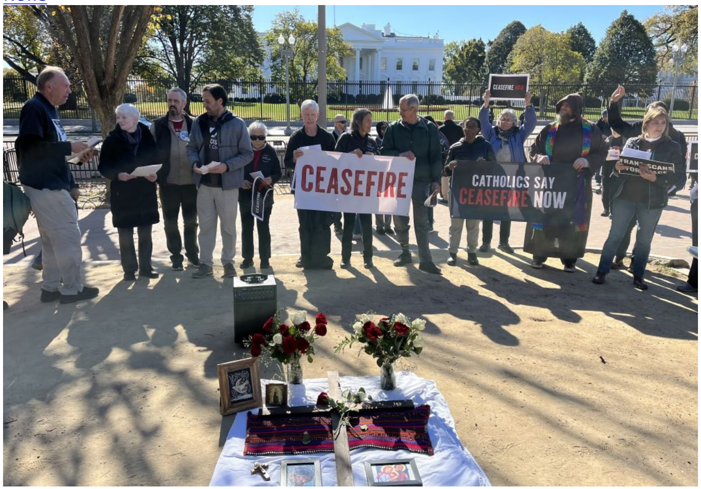
About 60 Catholics gathered for a pray-in outside the White House on Nov. 2. They called for President Joe Biden to support a cease-fire in the Holy Land and pursue diplomacy.