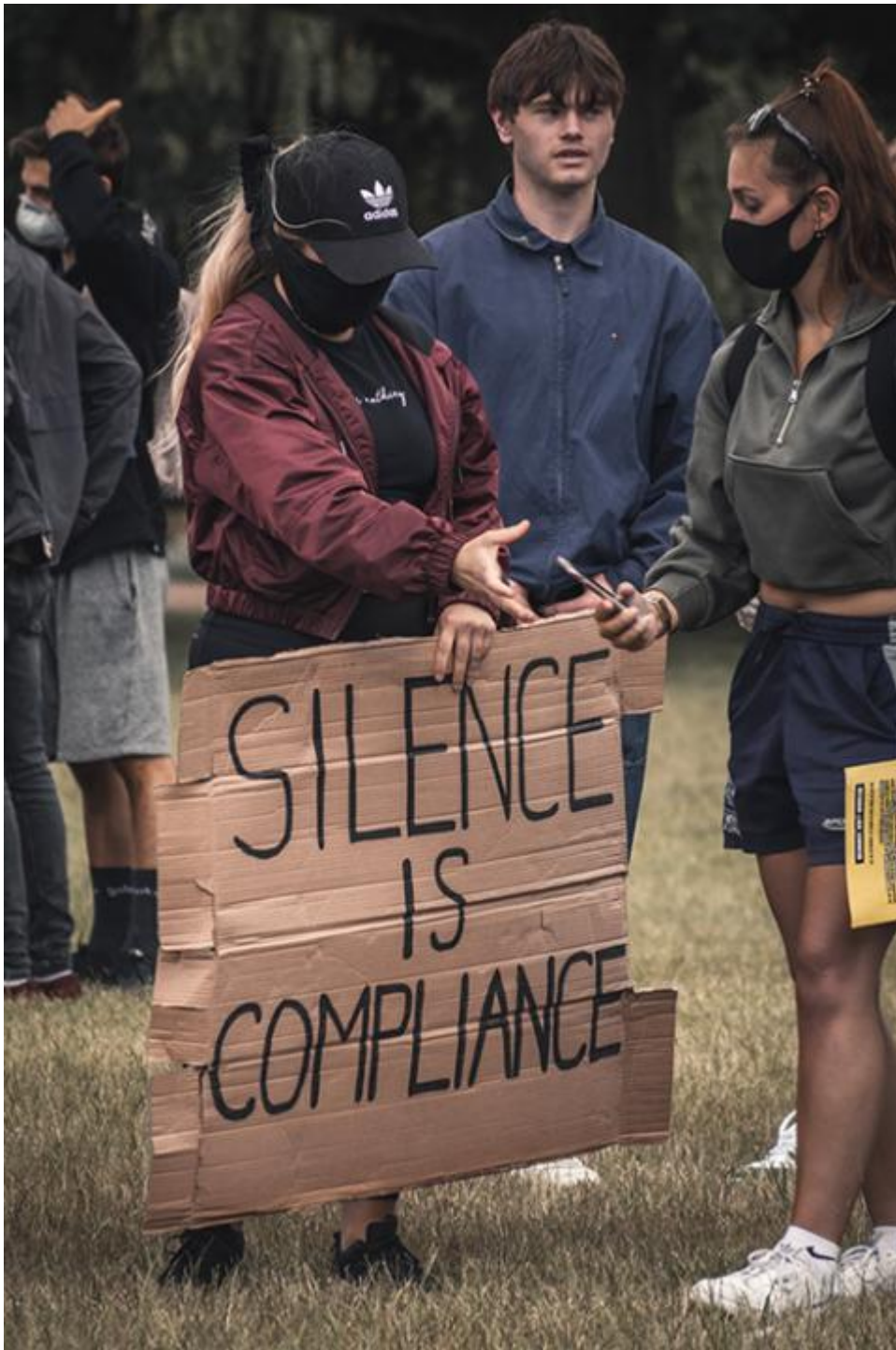
Black Lives Matter protesters in Leamington Spa, England, in June 2020

True Christian virtue does mean rejecting violent retaliation. It does mean choosing love over hate. Sometimes it means making sacrifices. But this doesn't mean we have no value or dignity or rights as persons. Nor does it eliminate our obligation to stand up for what is right and speak out clearly when someone is behaving in a