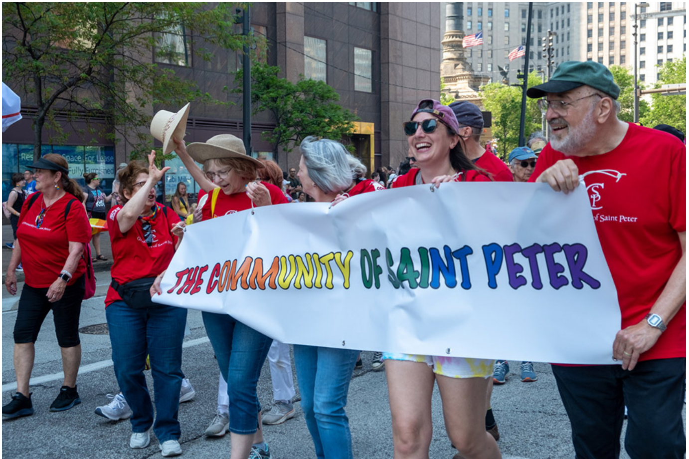
Members of the Community of St. Peter take part in the "Pride in the CLE" march in Cleveland on June 3.

"Sixteen hundred years ago, the church said to all the people who were experiencing domestic church, 'Here, let me do that for you.' And literally took it out of the hands of the people. ... And then all of a sudden it was put only into the hands of those who were designated as worthy."