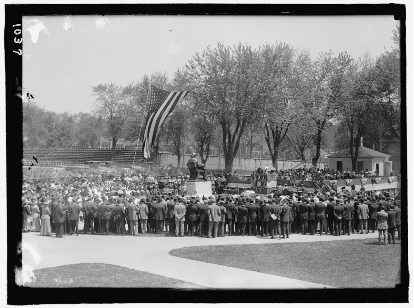
A photo of the May 4, 1912, dedication of the John Carroll statue at Georgetown University.