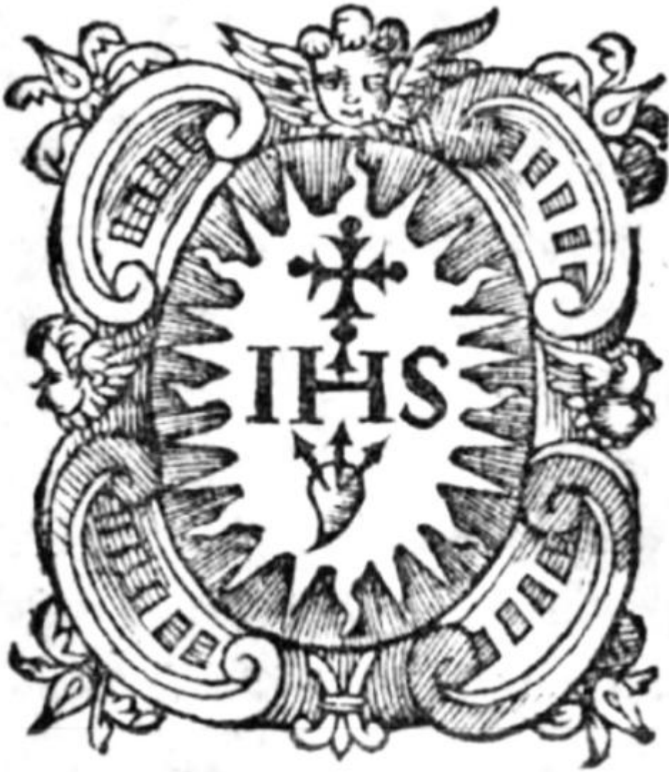
Emblem of the Society of Jesus, from a 1586 print