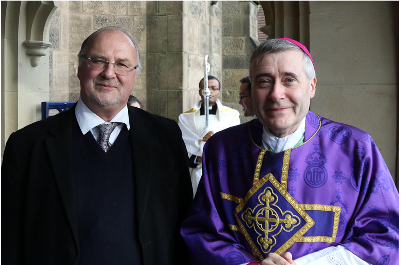
Gavin Ashenden (left), a former Anglican bishop, is pictured with Bishop Mark Davies of Shrewsbury, England, following Ashenden's reception into the Catholic faith Dec. 19, 2019.

Sometimes, the problem is not historical derangement but an inability to assume the good faith of the pope, combined with a bizarre need to exhibit the author's own fears. For example, the question is posed: "What Is Behind the 'Inclusion' Proposal?" The text quotes from Ashenden: