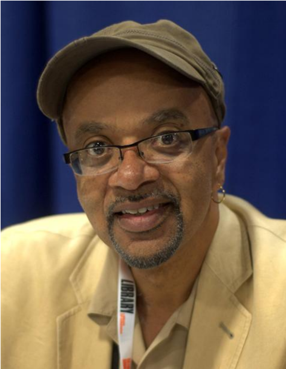
James McBride, author of The Heaven & Earth Grocery Store

After all, the title of McBride's best-selling debut memoir, The Color of Water — about his sprawling, biracial, Christian and Jewish, Northern and Southern family — comes from his mother's response when young James asks "whether God was black or white." And McBride's second book, the World War II novel Miracle at St. Anna , is set in motion by an object resting on a table as if "God had placed it there, which He, in fact, had."