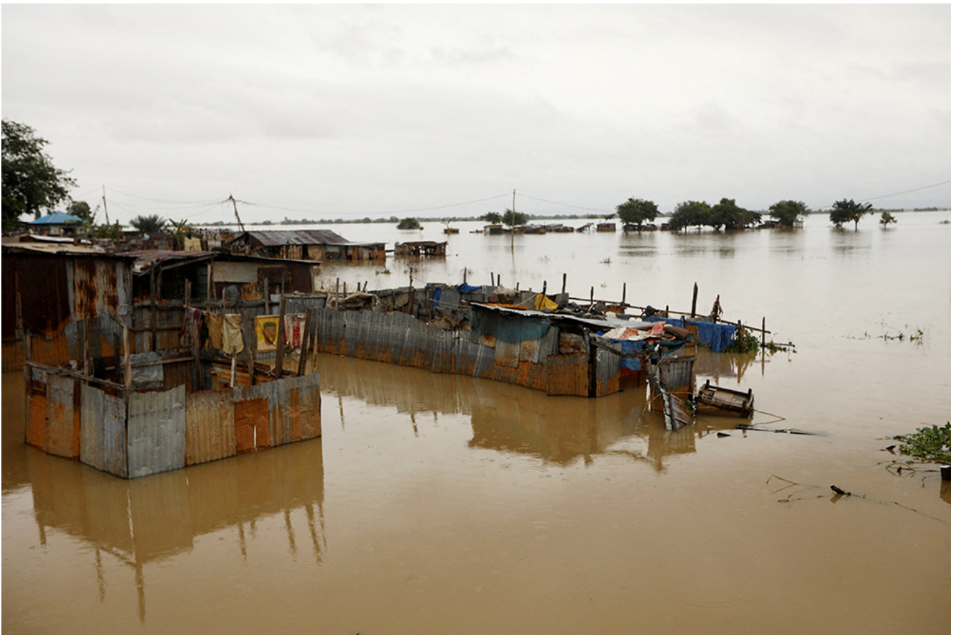
Houses are seen submerged in floodwaters in Lokoja, Nigeria, Oct.13, 2022.

Nigeria, the continent's most populous nation, is particularly vulnerable to the effects of climate change, and will take the biggest hit as data shows that climate change could reduce gross domestic product per capita by about 15% by 2050 in countries across East and West Africa.